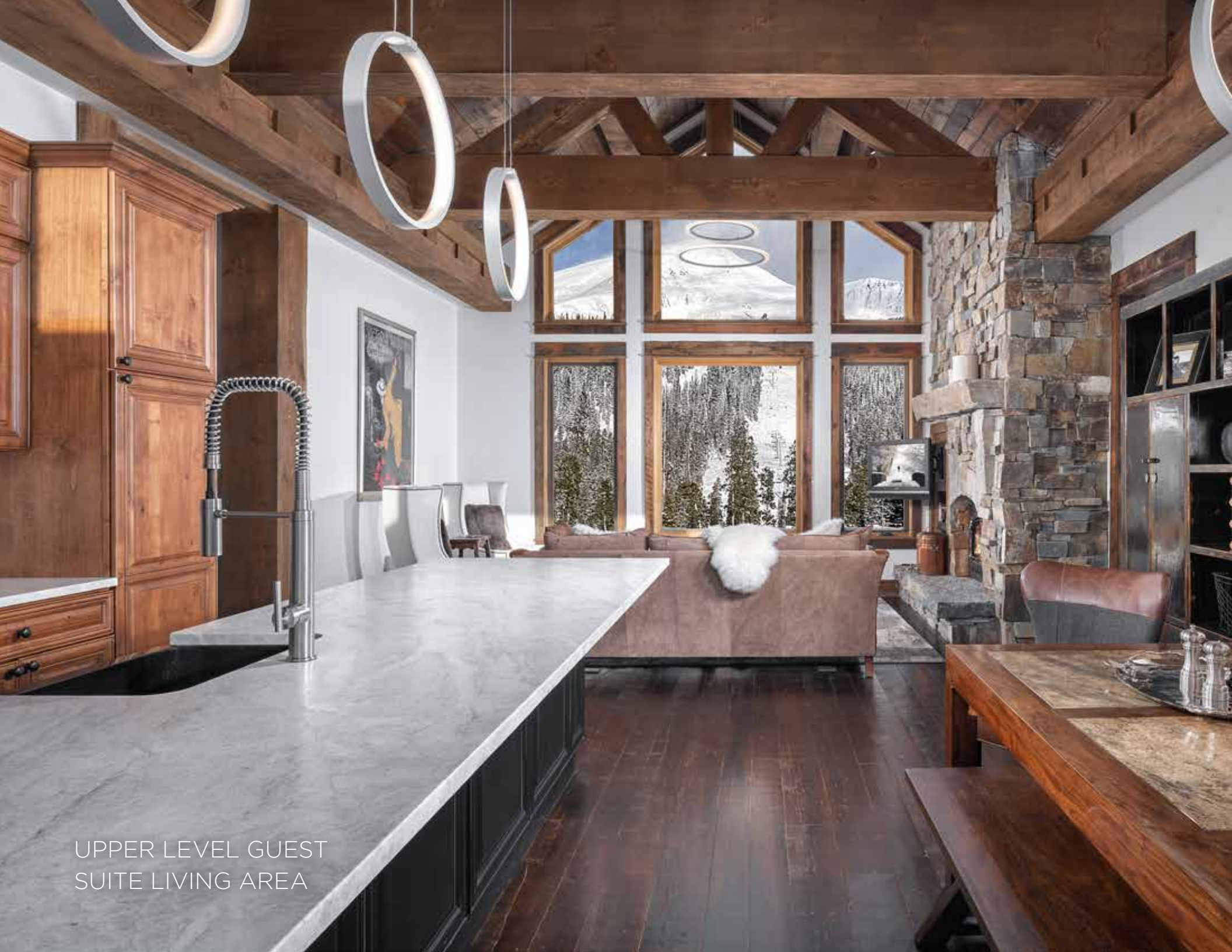
UPPER LEVEL GUEST SUITE LIVING AREA