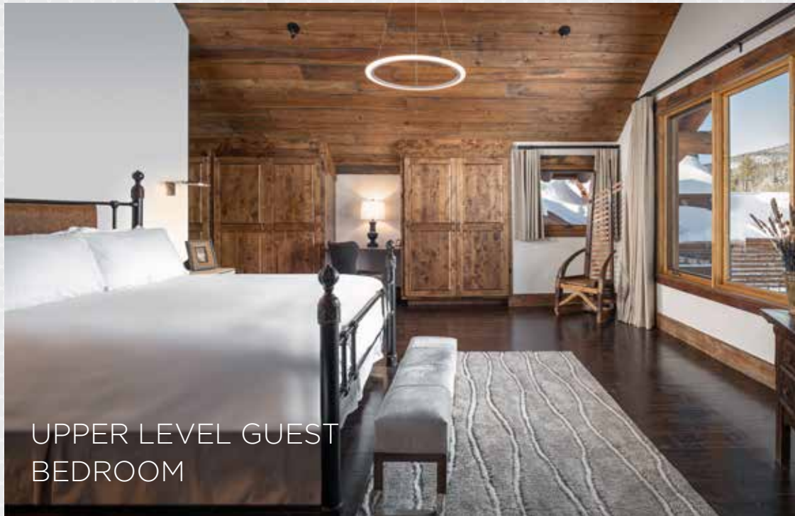
UPPER LEVEL GUEST BEDROOM