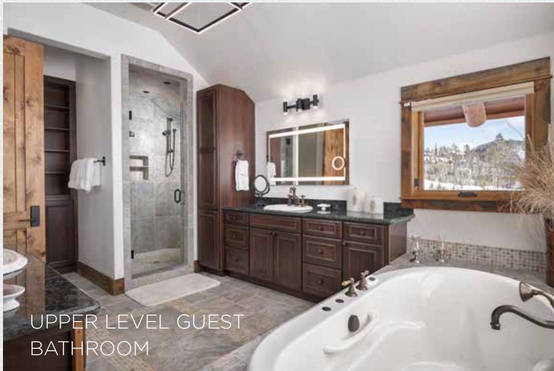
UPPER LEVEL GUEST BATHROOM