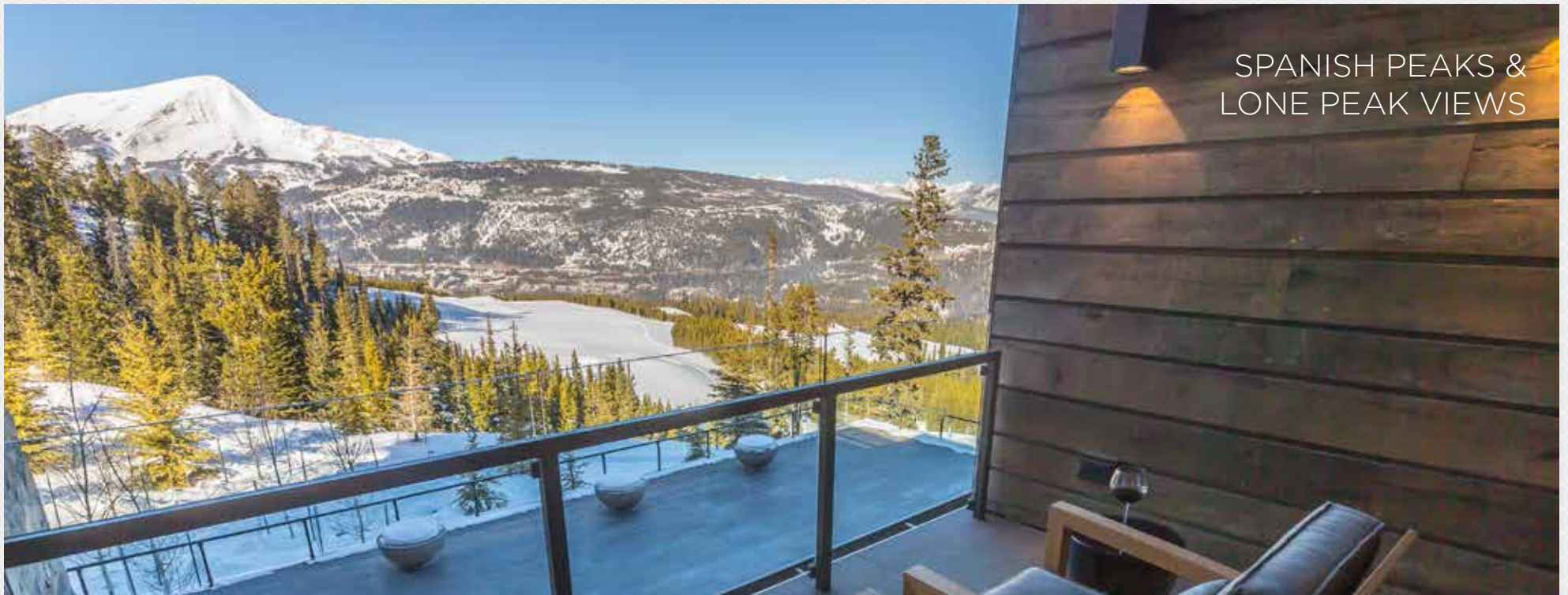
SPANISH PEAKS & LONE PEAK VIEWS