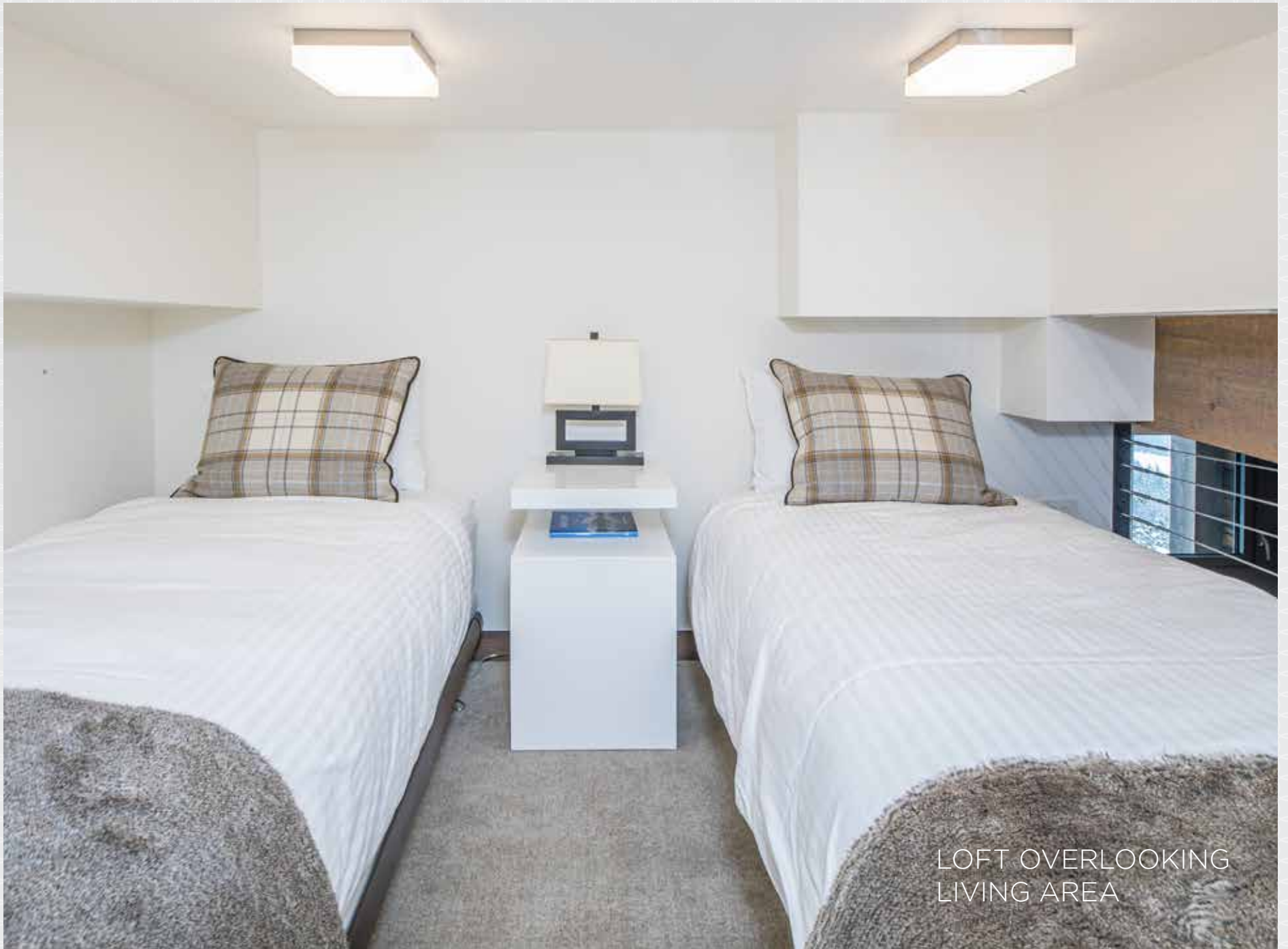
LOFT OVERLOOKING LIVING AREA