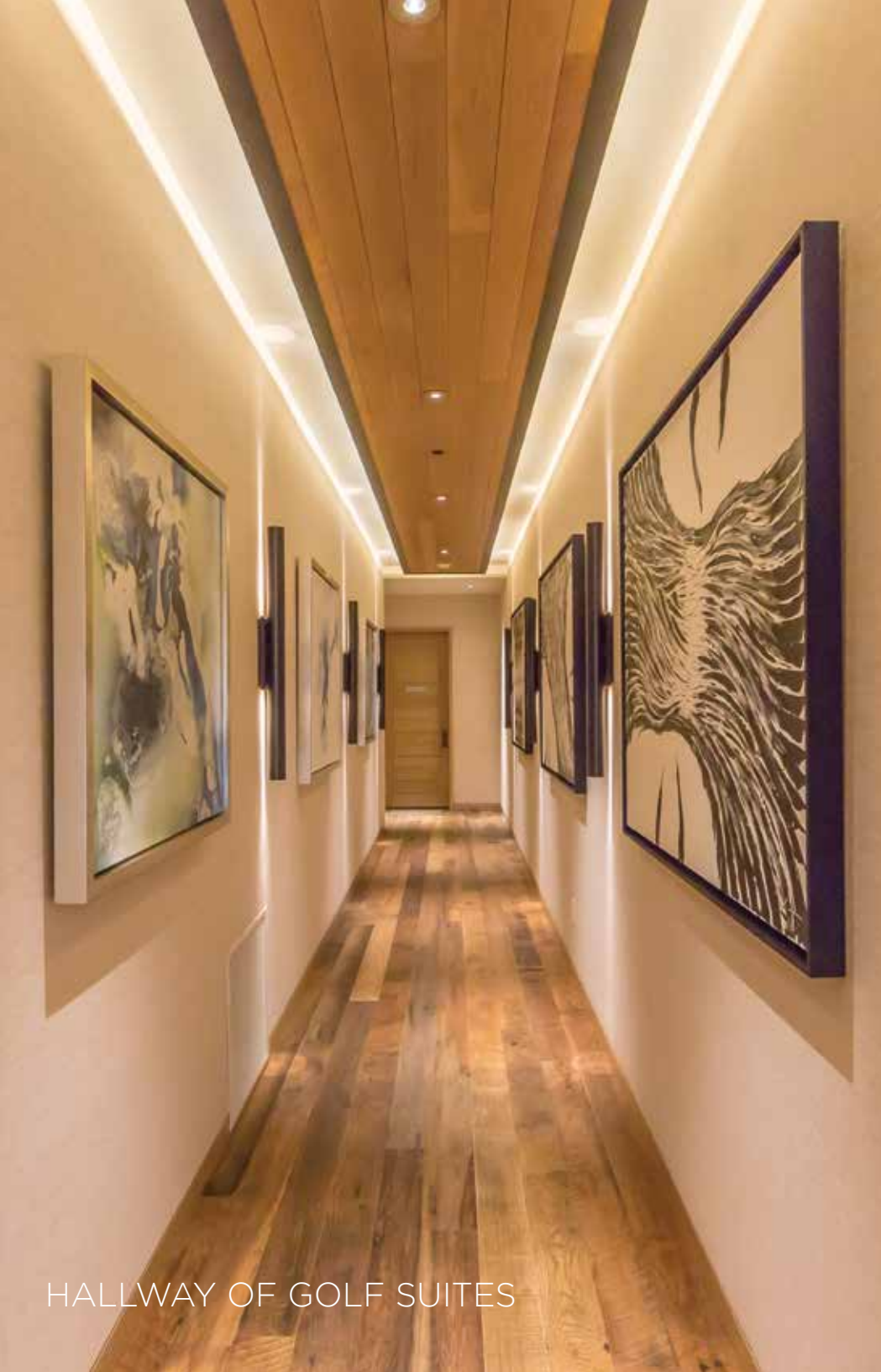
HALLWAY OF GOLF SUITES