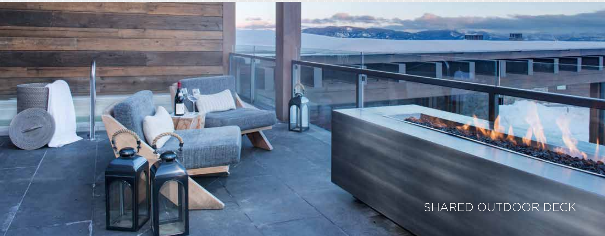
SHARED OUTDOOR DECK

This residence is located within Yellowstone Club, a 15,200 acre private, gated community located in Big Sky, Montana. Yellowstone Club is the world's only private ski and golf community, encompassing thousands of acres of private skiing along with a championship golf course designed by Tom Weiskopf. Additionally, whether looking to savor spectacular mountain panoramas, explore the vast wilderness or enjoy high-quality amenities, Yellowstone Club offers everything from fly fishing, hiking and biking trails to fine dining and spa services. Professional SnowSports, golf and outdoor recreation programs, along with dedicated children's activities, round out the unique Montana experience that is Yellowstone Club.