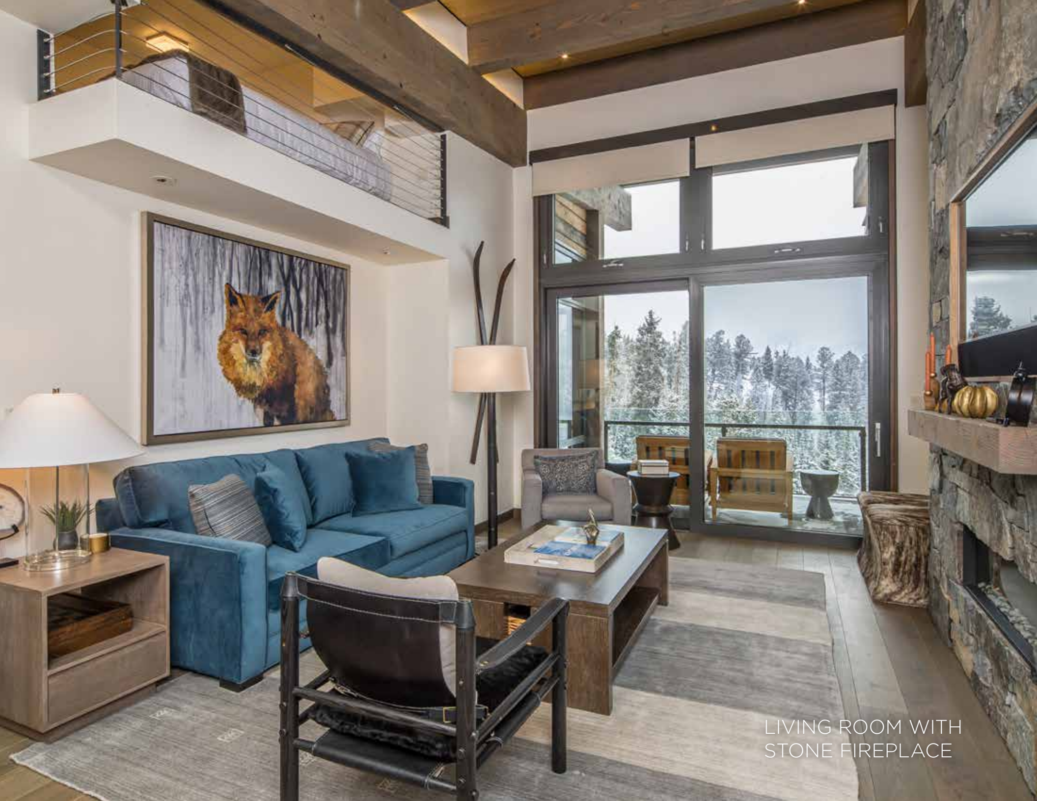
LIVING ROOM WITH STONE FIREPLACE