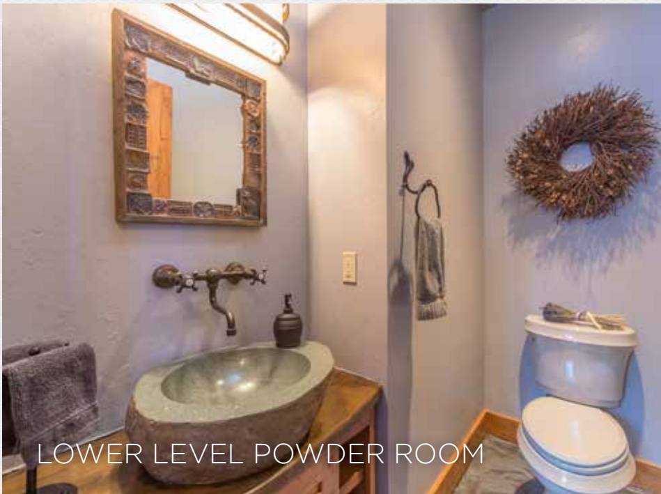
LOWER LEVEL POWDER ROOM