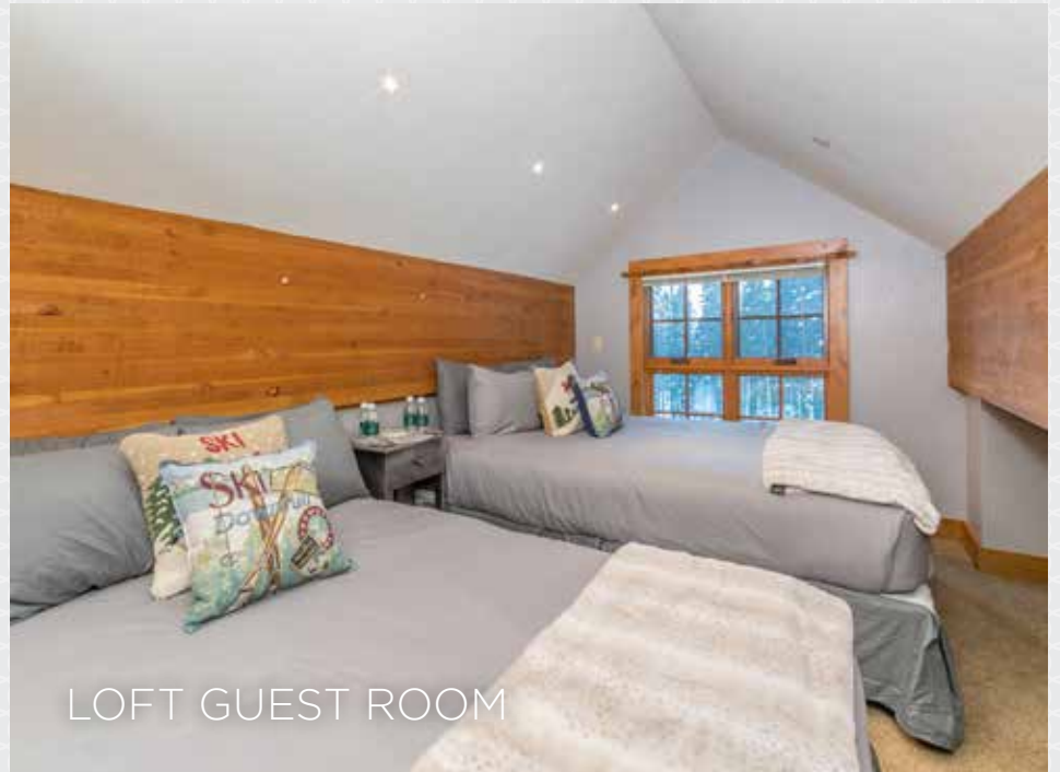
LOFT GUEST ROOM