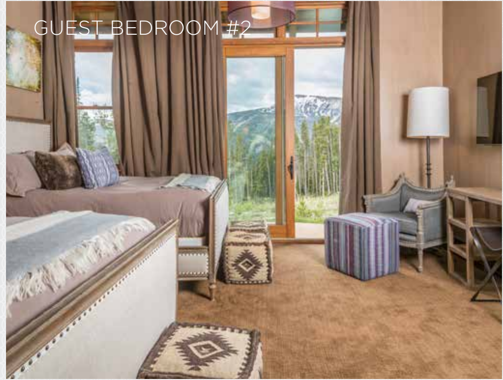
GUEST BEDROOM #2