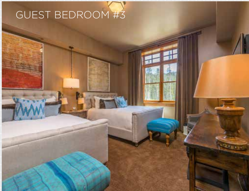
GUEST BEDROOM #3