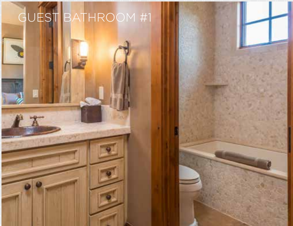
GUEST BATHROOM #1