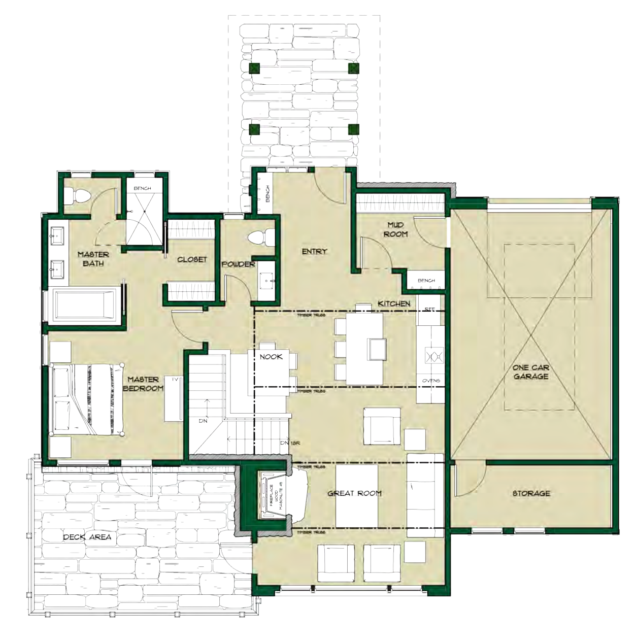
Main Level Plan