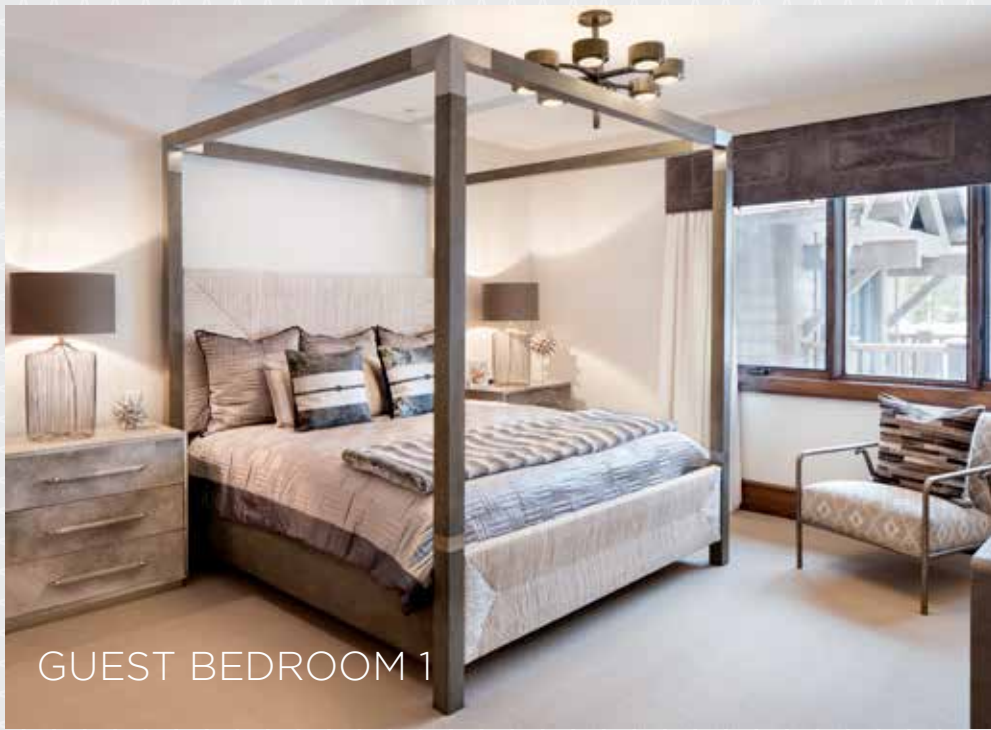
GUEST BEDROOM 1