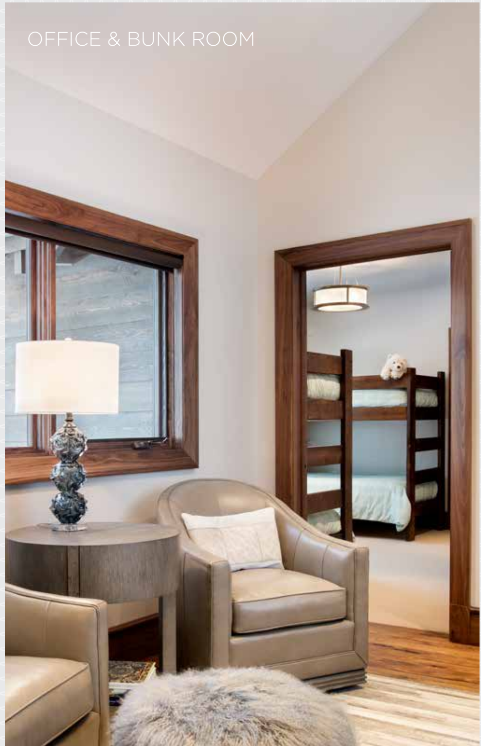
OFFICE & BUNK ROOM