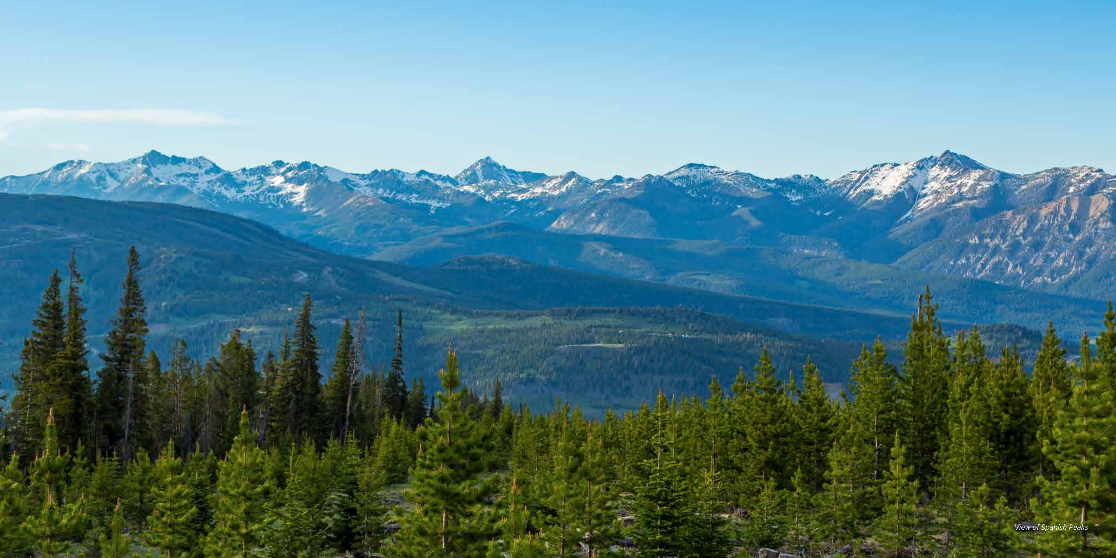
View of Spanish Peaks