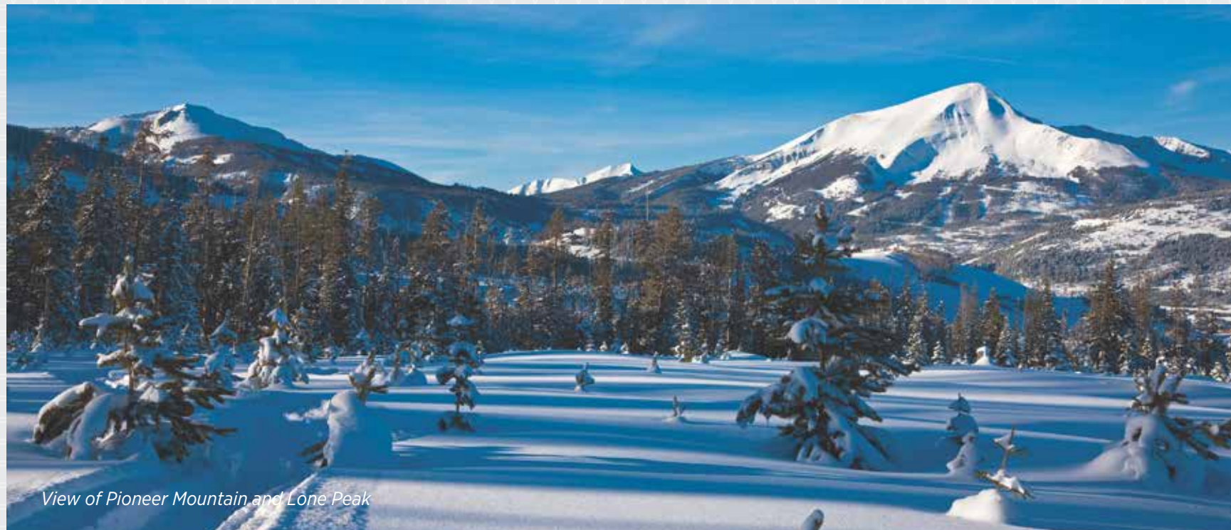
View of Pioneer Mountain and Lone Peak