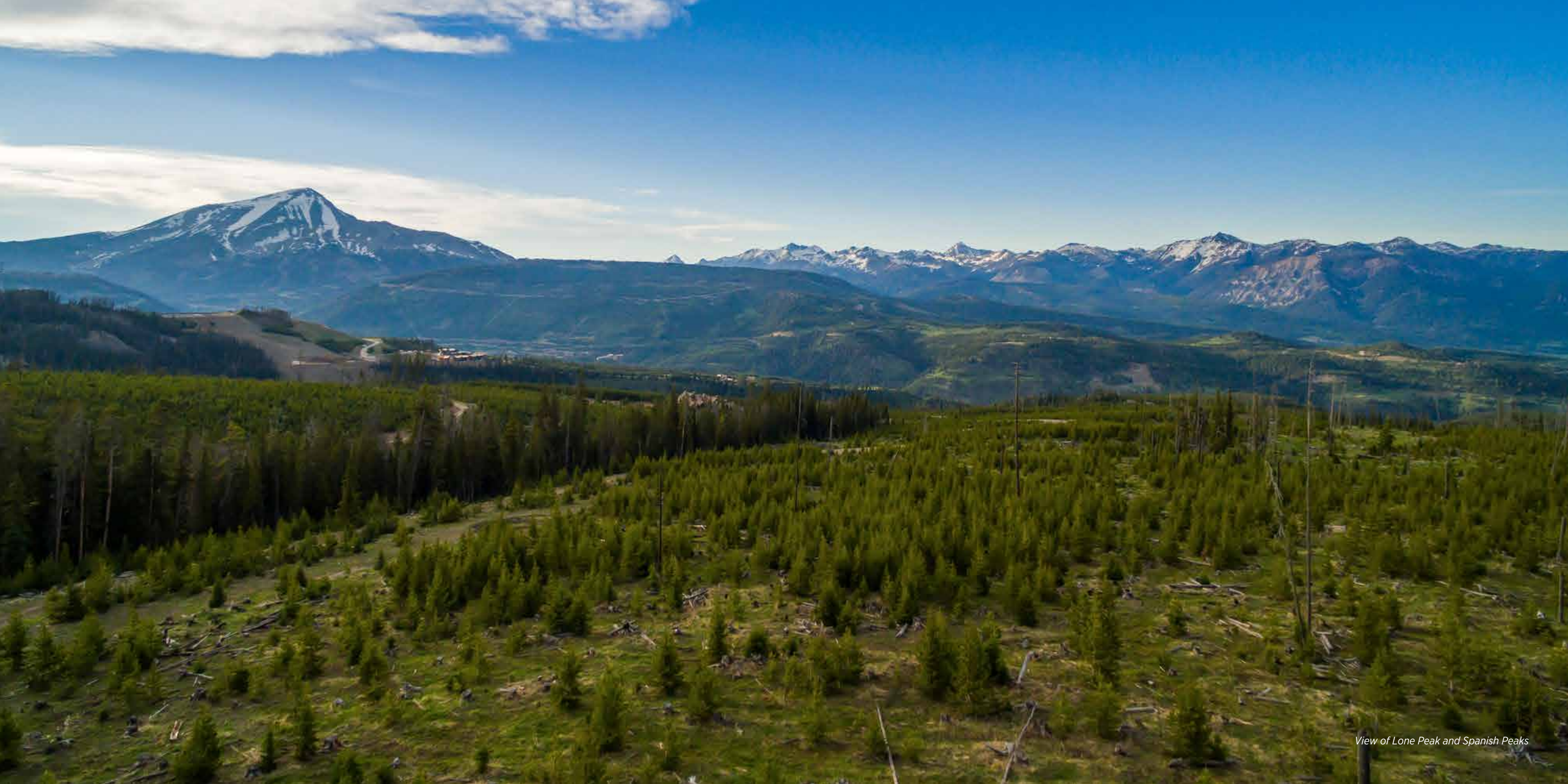
View of Lone Peak and Spanish Peaks