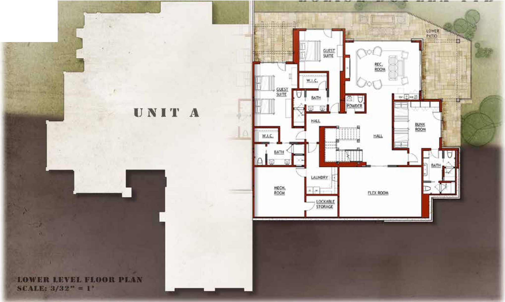
LOWER LEVEL FLOOR PLAN SCALE: 3/32" = 1'