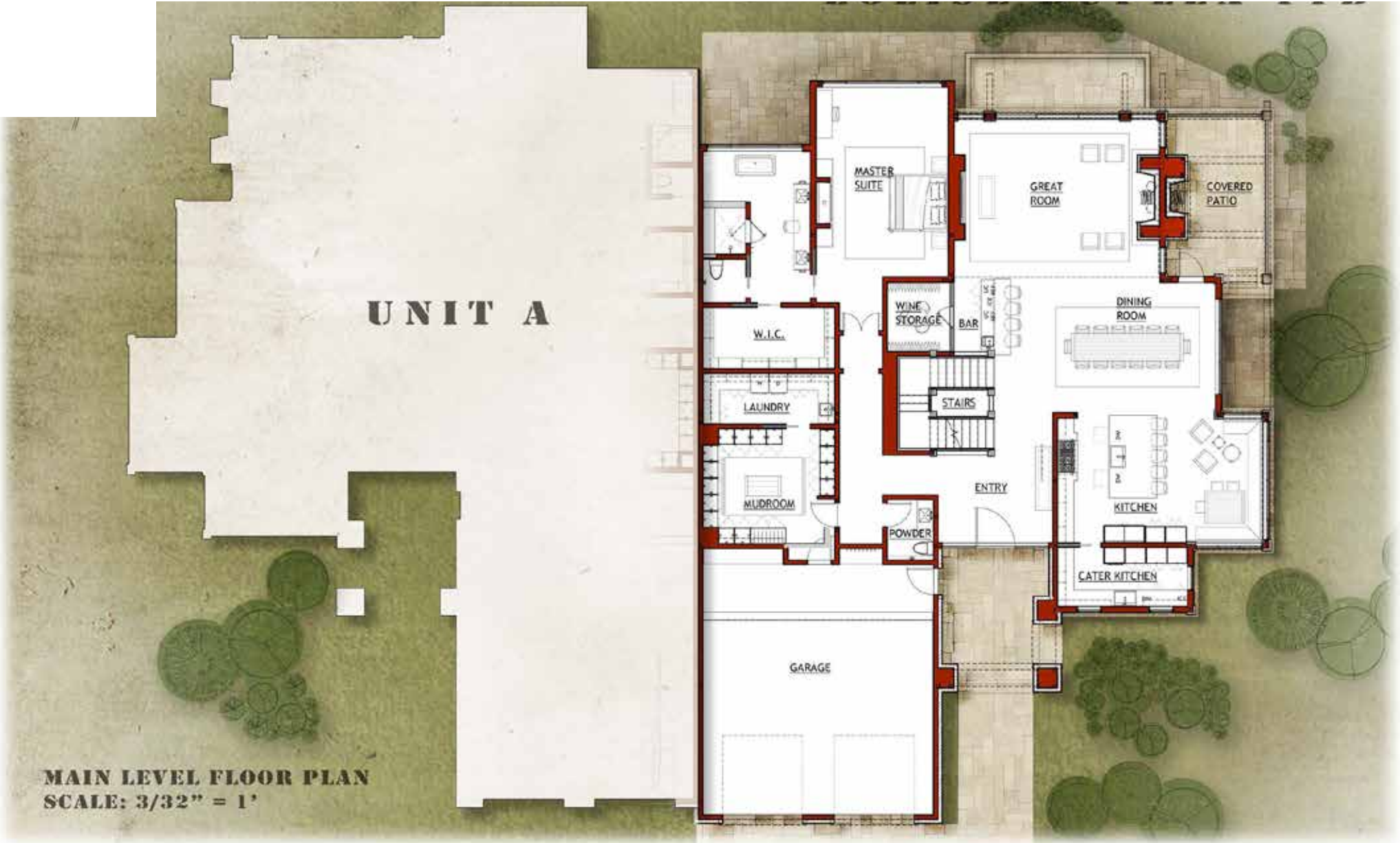
MAIN LEVEL FLOOR PLAN SCALE: 3/32" = 1'