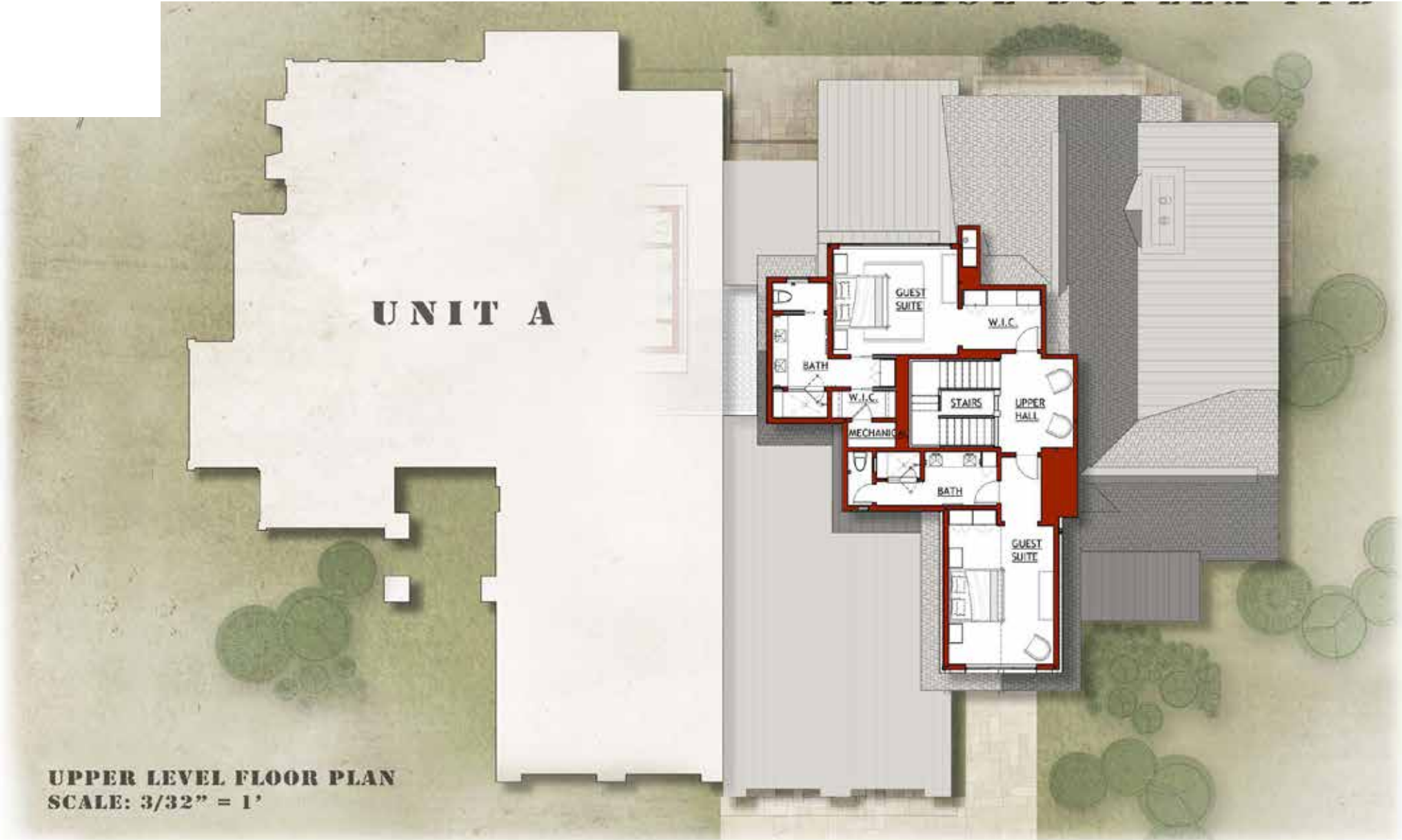
UPPER LEVEL FLOOR PLAN SCALE: 3/32" = 1'