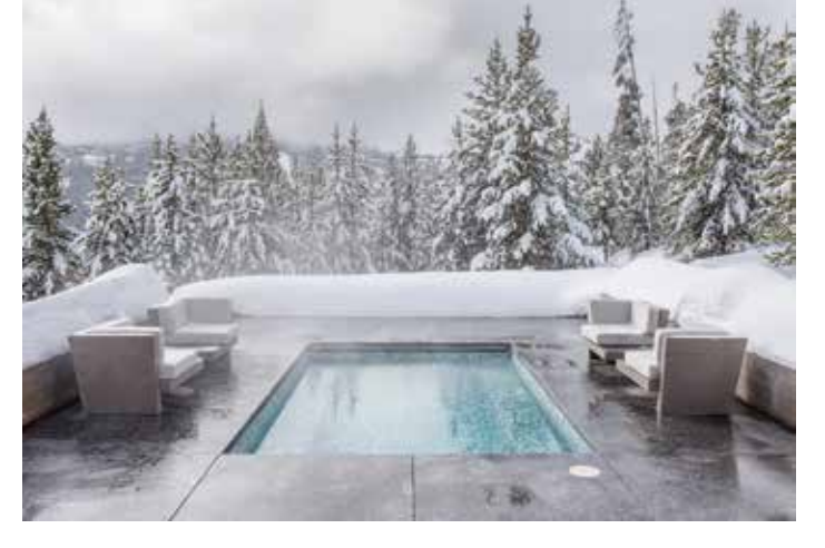
From top: A heated plunge pool looks out to the mountain views. Stuart Silk Interiors designed the poured-concrete outdoor furniture. The home sits near a Yellowstone Club ski trail, allowing for skiin-ski-out convenience for the homeowners and their guests.