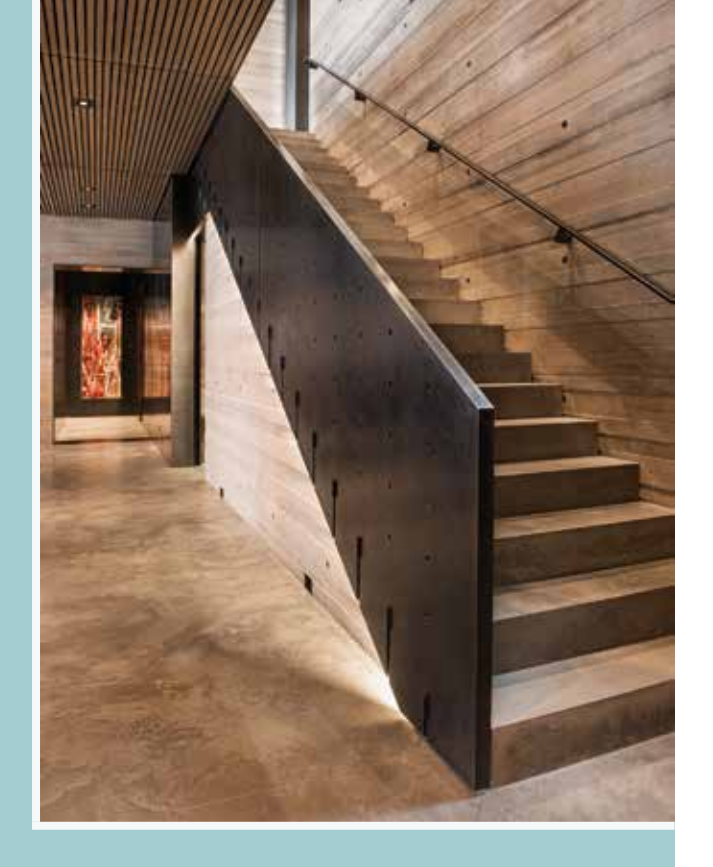
ski-in-ski-out experience, it was the for family gatherings.