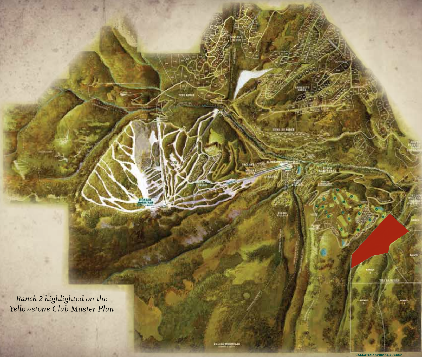
Ranch 2 highlighted on the Yellowstone Club Master Plan