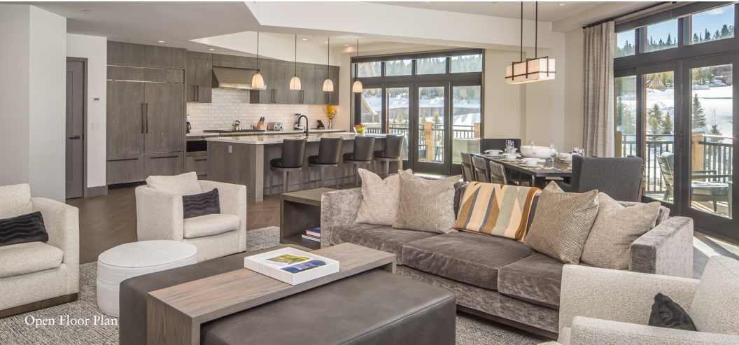
Open Floor Plan