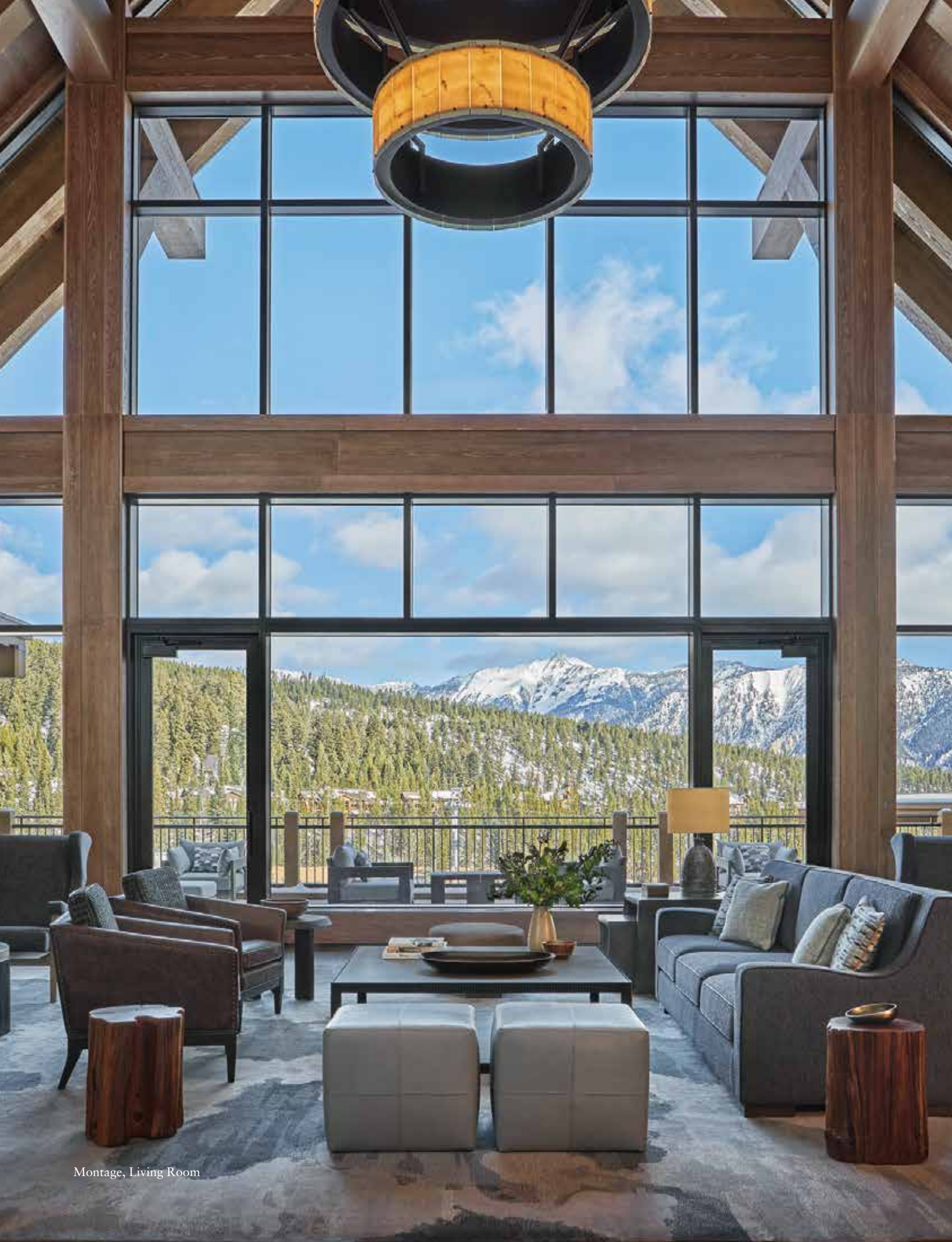
Montage, Living Room