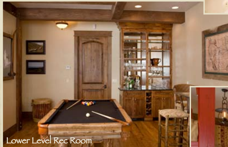
Lower Level Rec Room