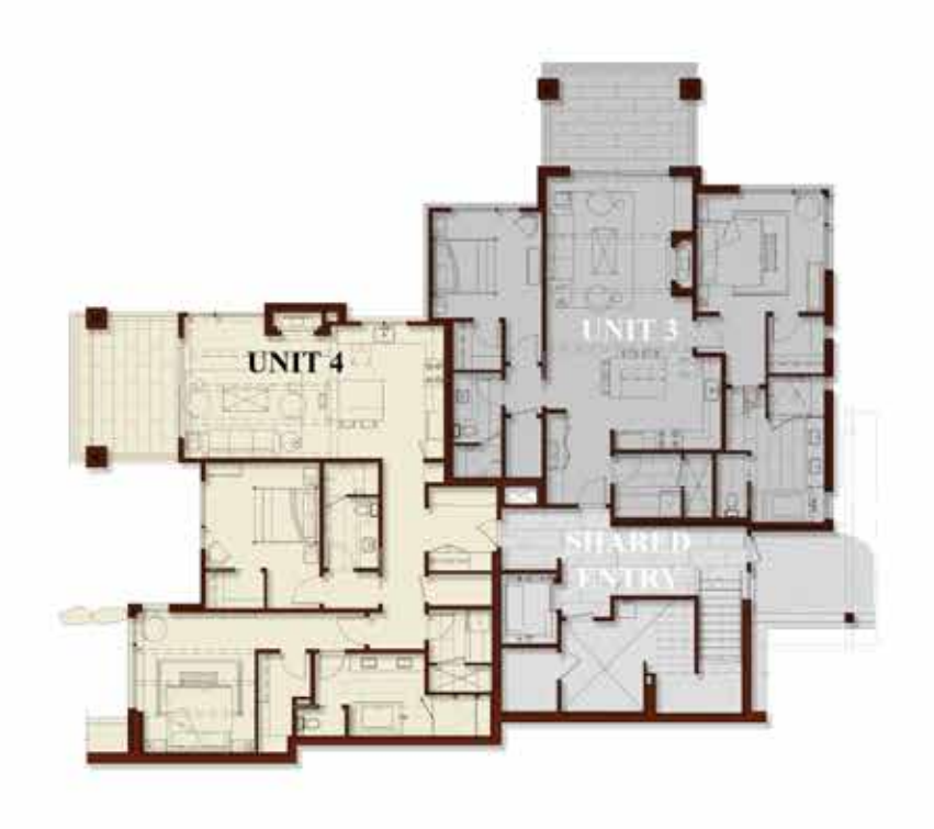
<u>E AND F</u>