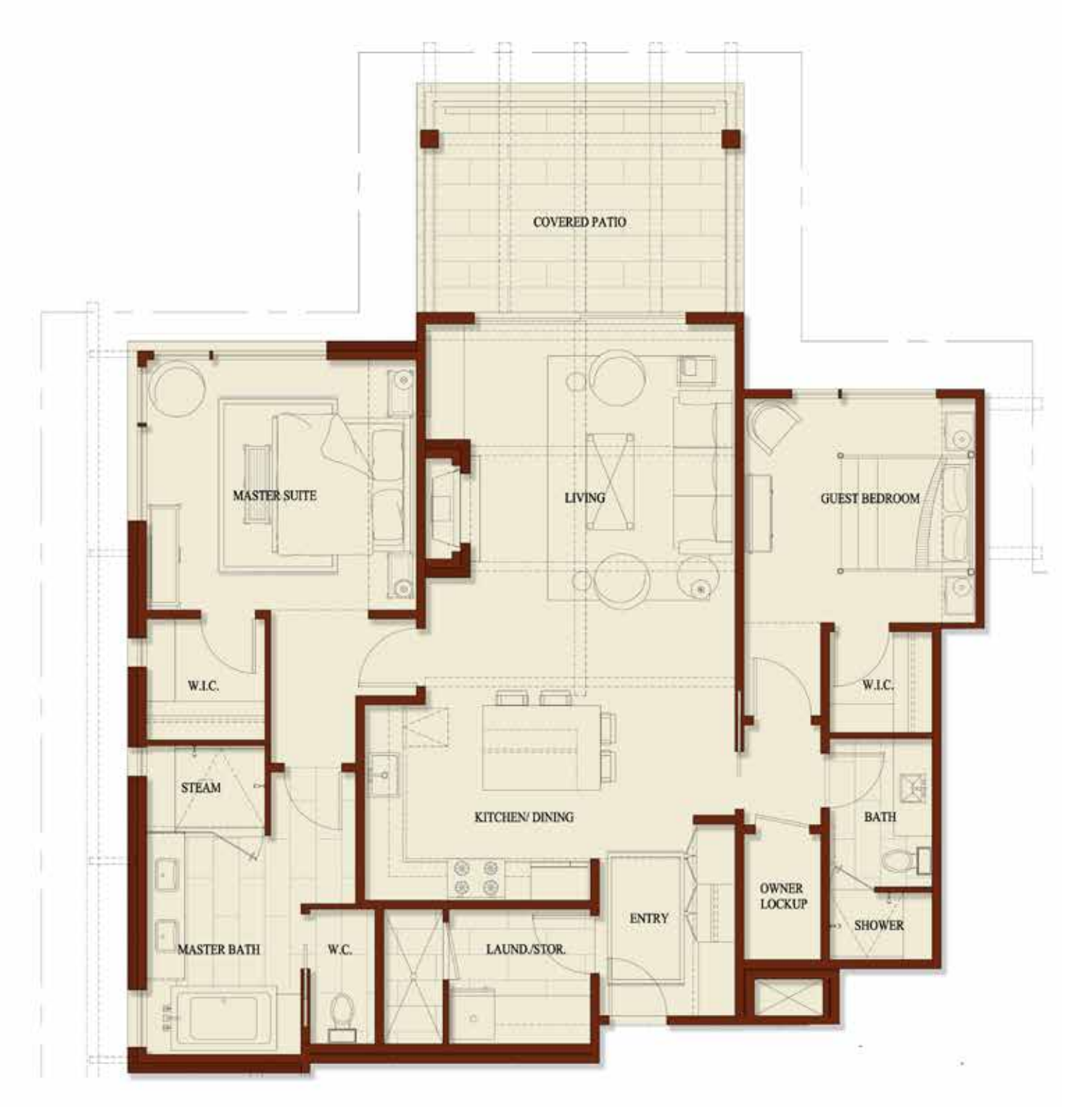
UNIT 1 / 1,513 SQ. FT. / 2BR, 2BA