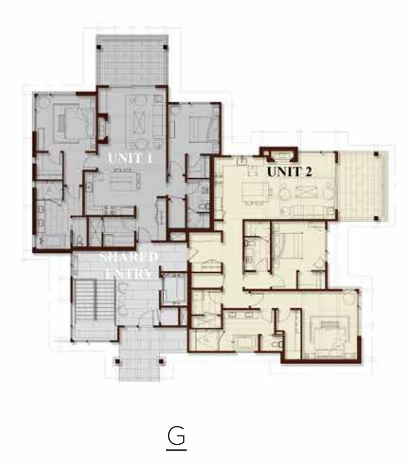
KITCHEN/ DINING COVERED PATIO ENTRY GUEST BEDROOM OWNER LOCKUP MASTER BATH