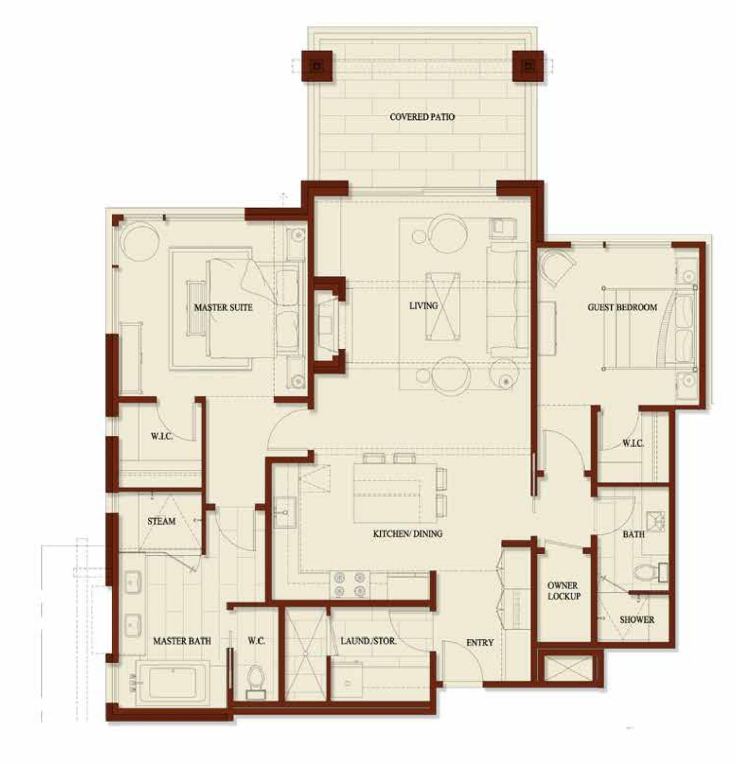
UNIT 3 / 1,513 SQ. FT. / 2BR, 2BA