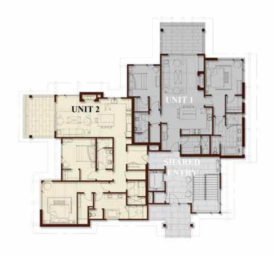
<u>E AND F</u>