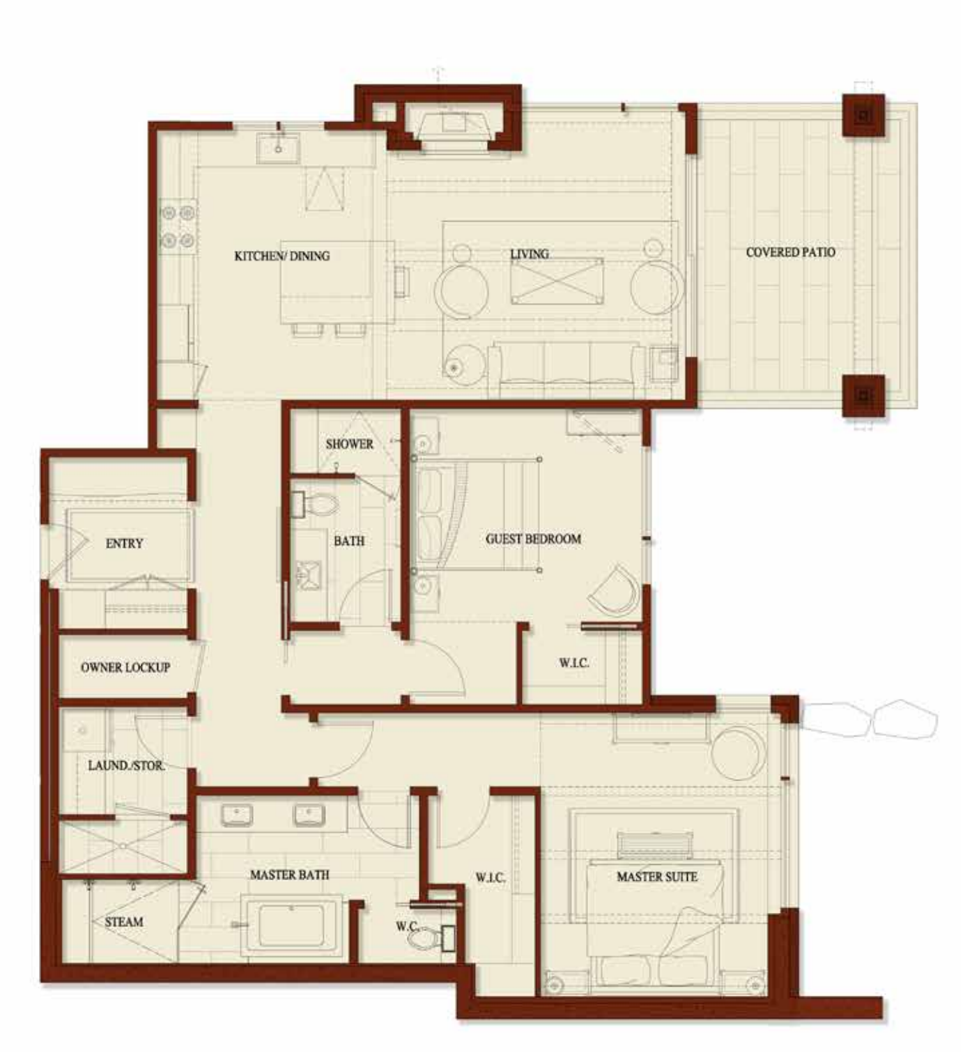
ALPINE GREENS VILLAS II