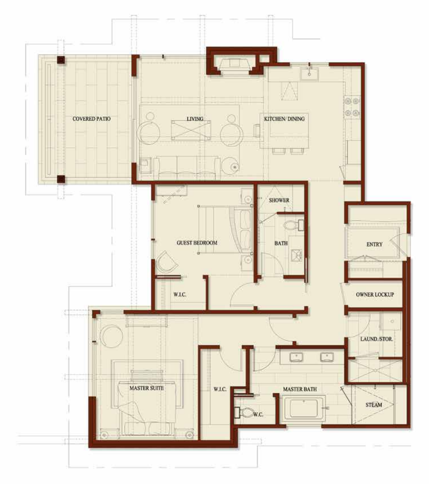
UNIT 2 / 1,633 SQ. FT. / 2BR, 2BA