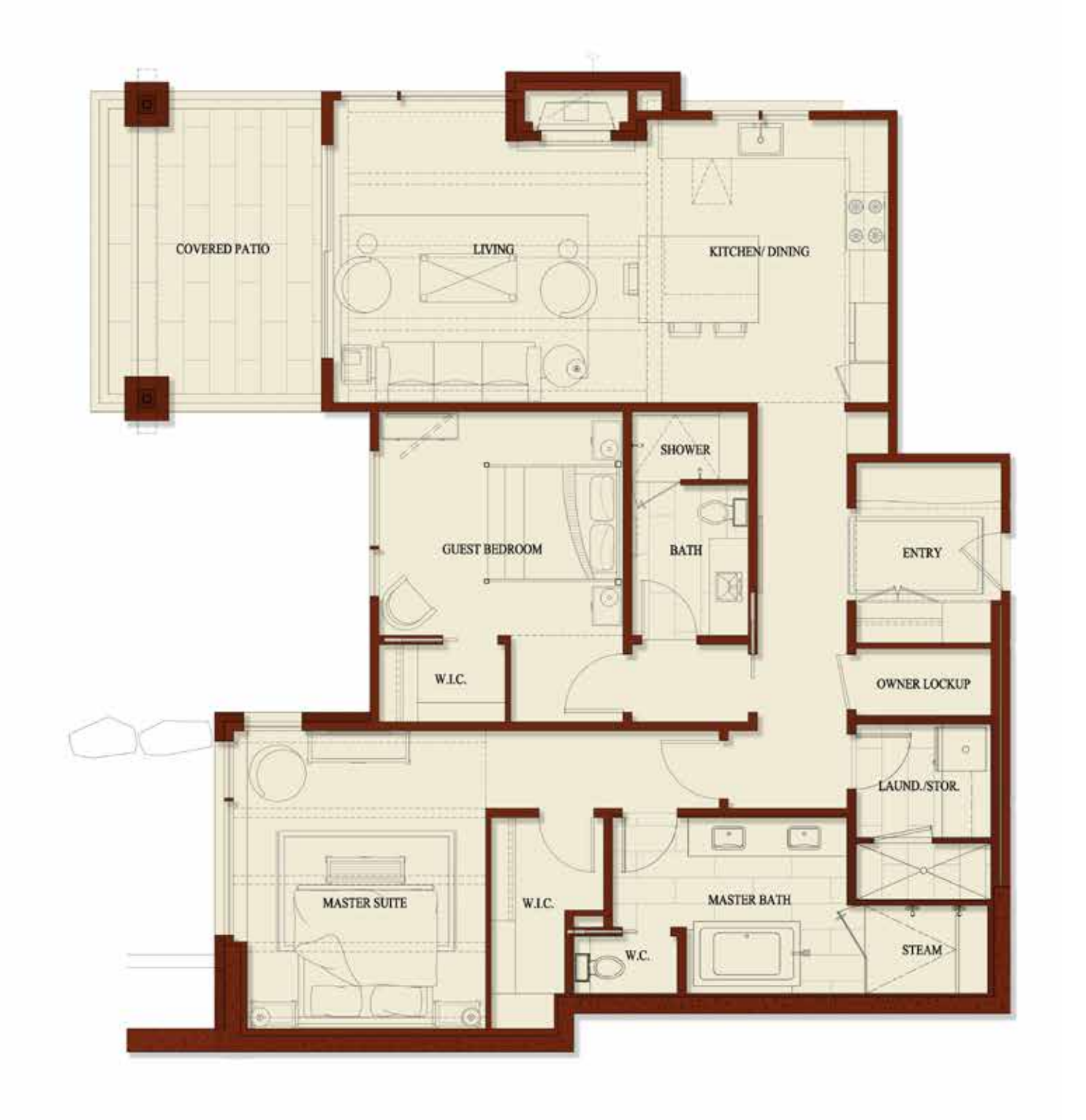
UNIT 4 / 1,632 SQ. FT. / 2BR, 2BA