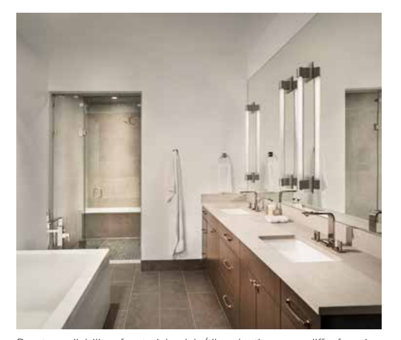
Due to availability of materials, slab/tile selections may differ from image shown. Please see final interior selections document to confirm.