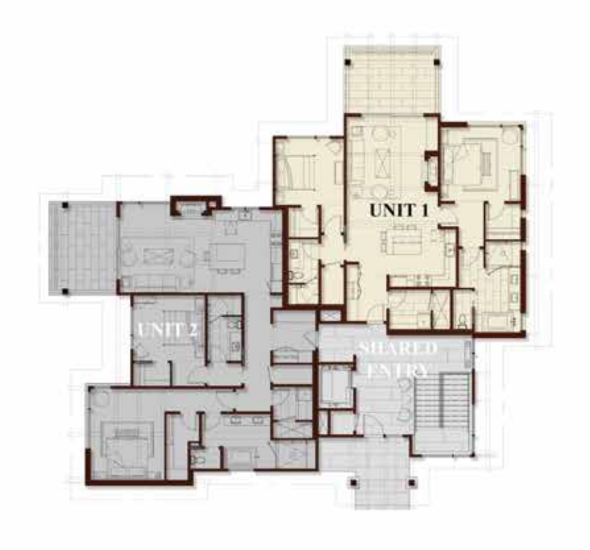
<u>E AND F</u>