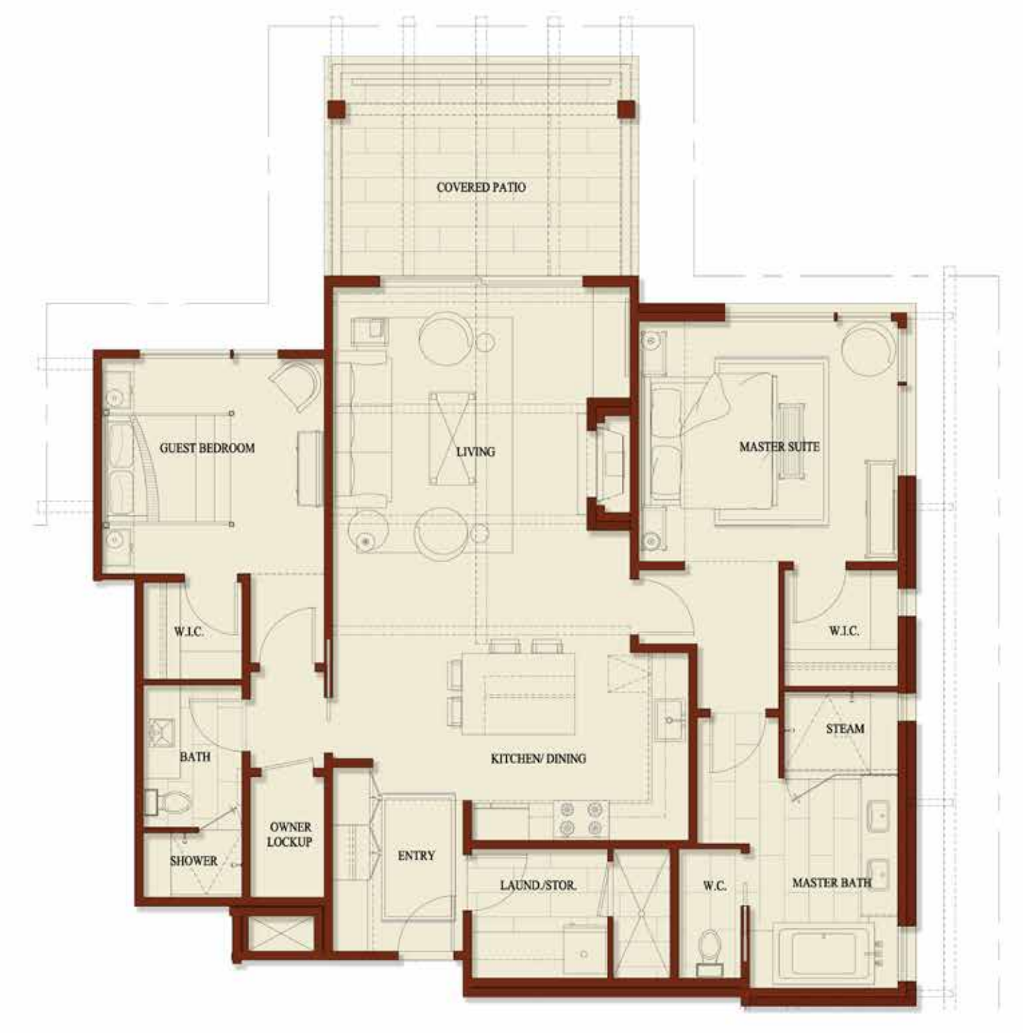
UNIT 1 / 1,513 SQ. FT. / 2BR, 2BA