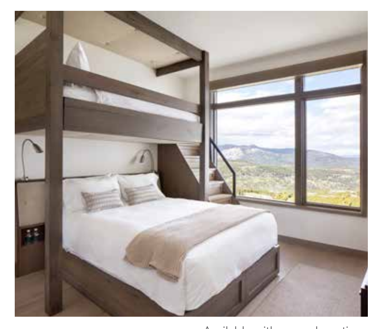
Available with upgrade options