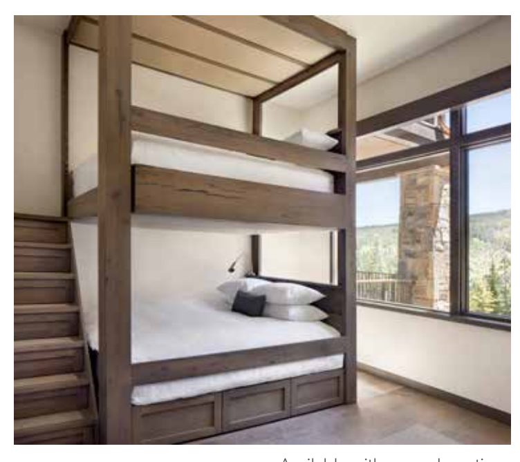
Available with upgrade options