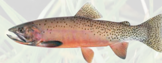
WESTSLOPE CUTTHROAT TROUT

Today, this fish is recognized as an important part of the state's history and ecosystem; efforts have been undertaken to protect the fish and ensure its longevity as a population. The Westslope Cutthroat is now designated a Species of Concern in Montana. This, together with its designation as the state fish, have increased visibility for this fragile population, and conservation efforts are underway to protect this fish. The Yellowstone Club is proud to be a part of the Westslope Cutthroat's history and future, and always promotes sensible and sustainable fishing on Club property. Every precaution is taken to preserve the genetic integrity of this fish species so future generations can enjoy it for years to come.