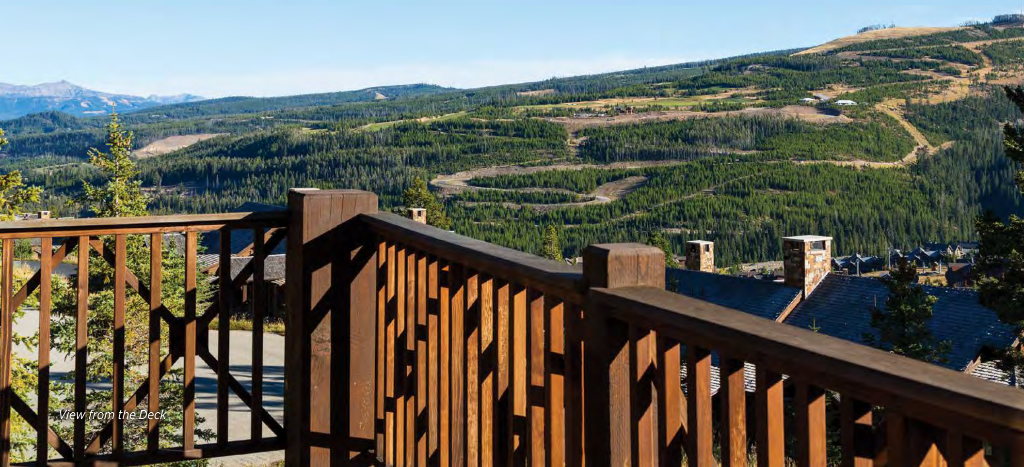
View from the Deck