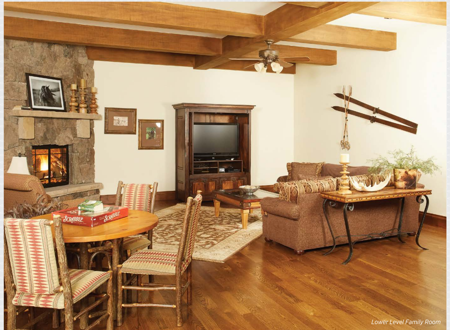
Lower Level Family Room