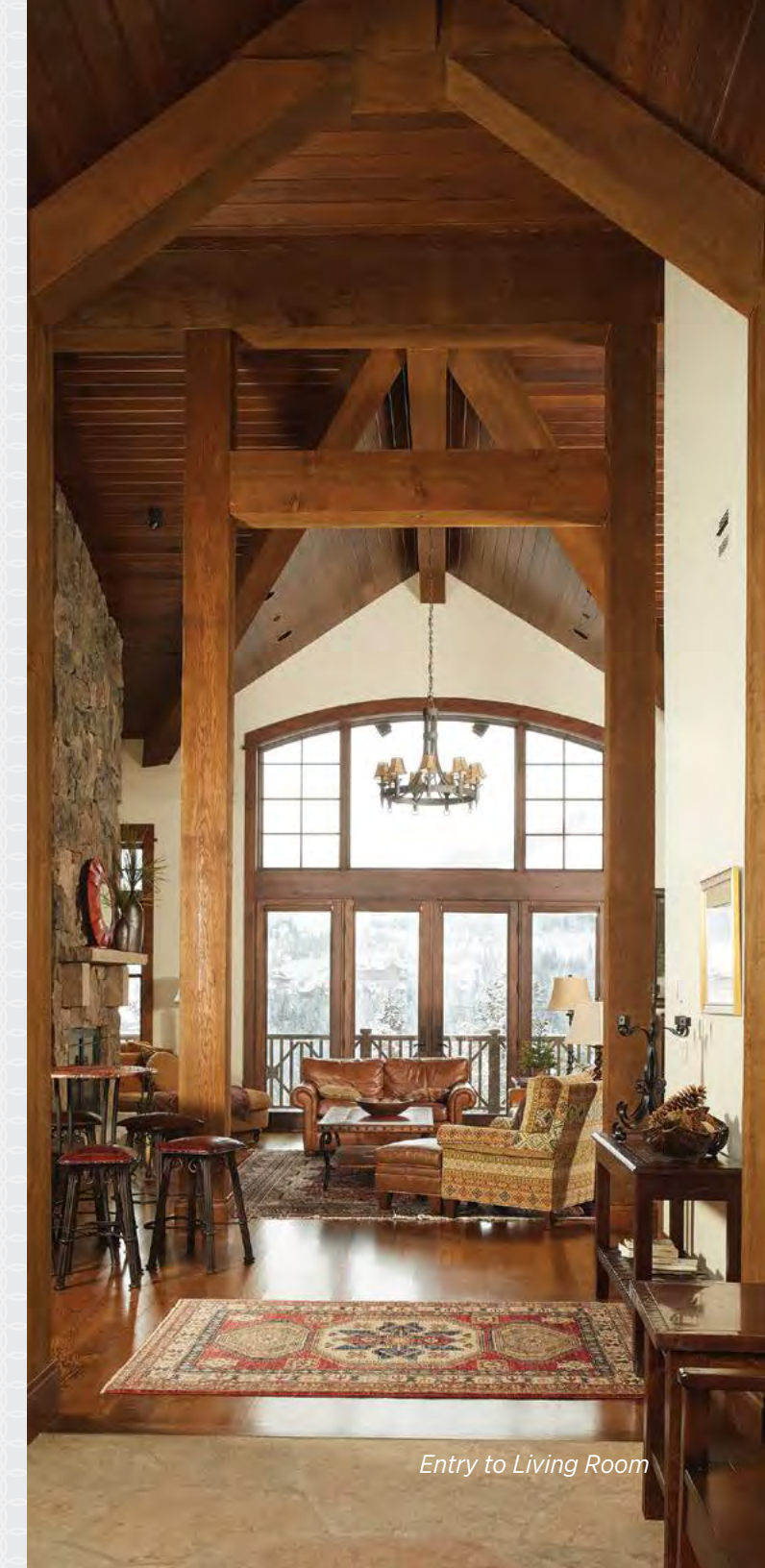
Entry to Living Room

This residence is located within Yellowstone Club, a 13,600 acre private, gated community located in Big Sky, Montana. Yellowstone Club is the world's only private ski and golf community, encompassing thousands of acres of private skiing along with a championship golf course designed by Tom Weiskopf. Additionally, whether looking to savor spectacular mountain panoramas, explore the vast wilderness or enjoy high-quality amenities, Yellowstone Club offers everything from fly fishing, hiking and biking trails to fine dining and spa services. Professional SnowSports, golf and outdoor recreation programs, along with dedicated children's activities, round out the unique Montana experience that is Yellowstone Club.