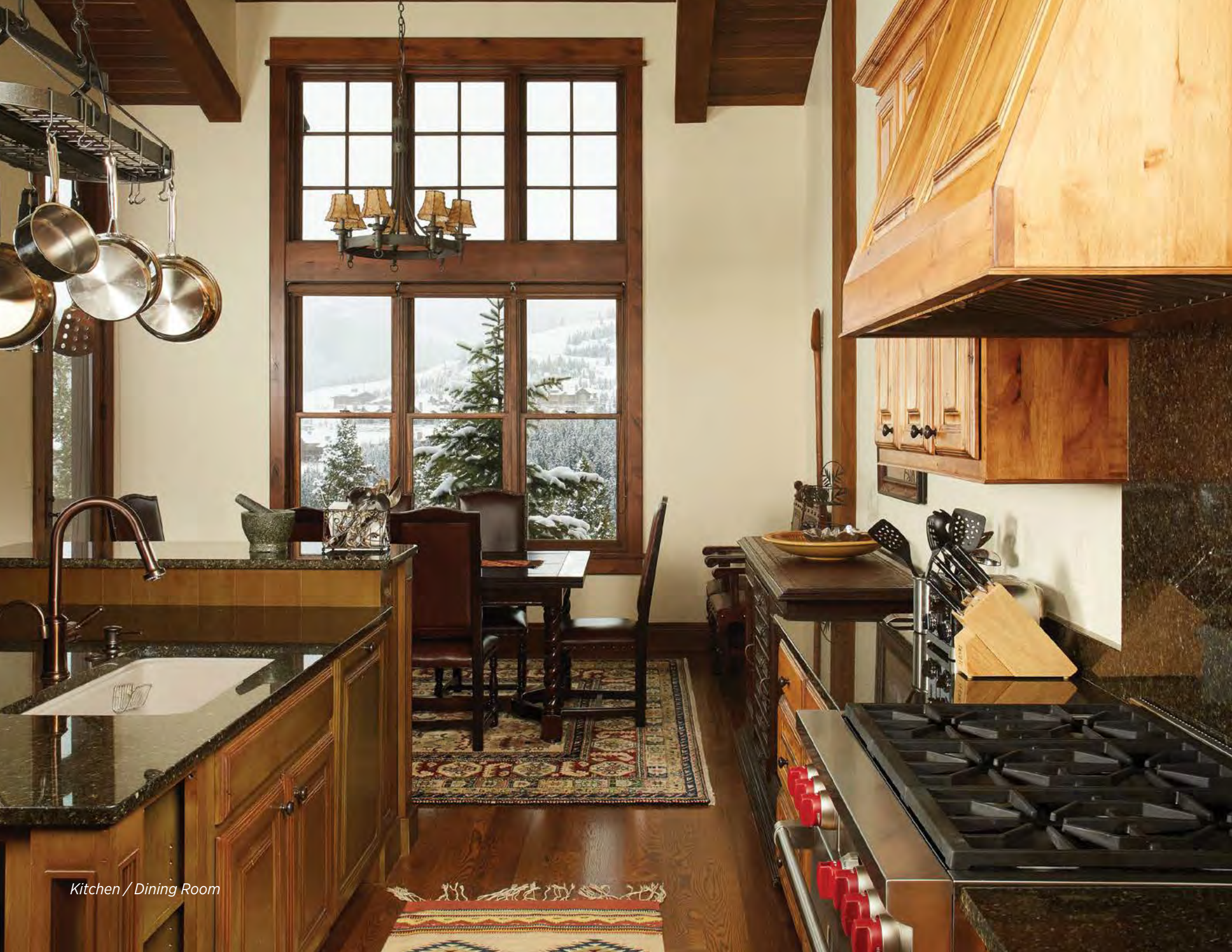
Kitchen / Dining Room