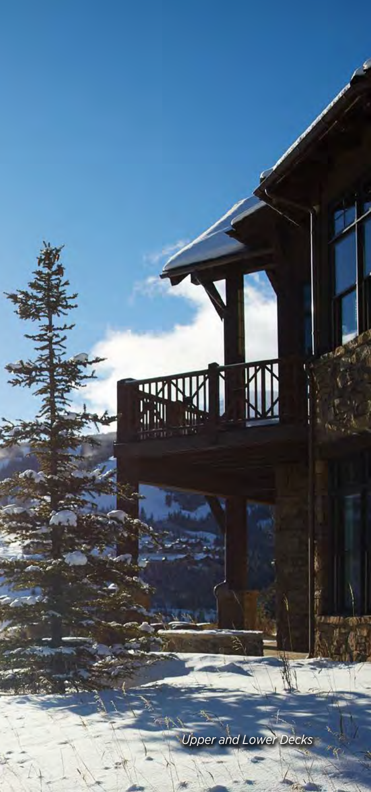
Upper and Lower Decks

This residence is located within Yellowstone Club, a 13,600 acre private, gated community located in Big Sky, Montana. Yellowstone Club is the world's only private ski and golf community, encompassing thousands of acres of private skiing along with a championship golf course designed by Tom Weiskopf. Additionally, whether looking to savor spectacular mountain panoramas, explore the vast wilderness or enjoy high-quality amenities, Yellowstone Club offers everything from fly fishing, hiking and biking trails to fine dining and spa services. Professional SnowSports, golf and outdoor recreation programs, along with dedicated children's activities, round out the unique Montana experience that is Yellowstone Club.