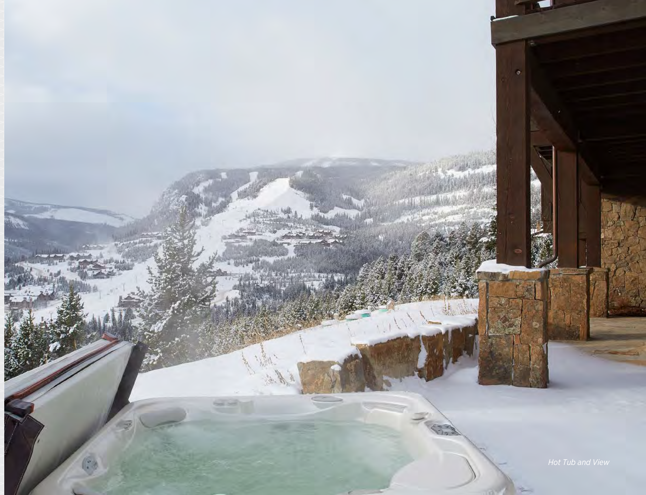
Hot Tub and View