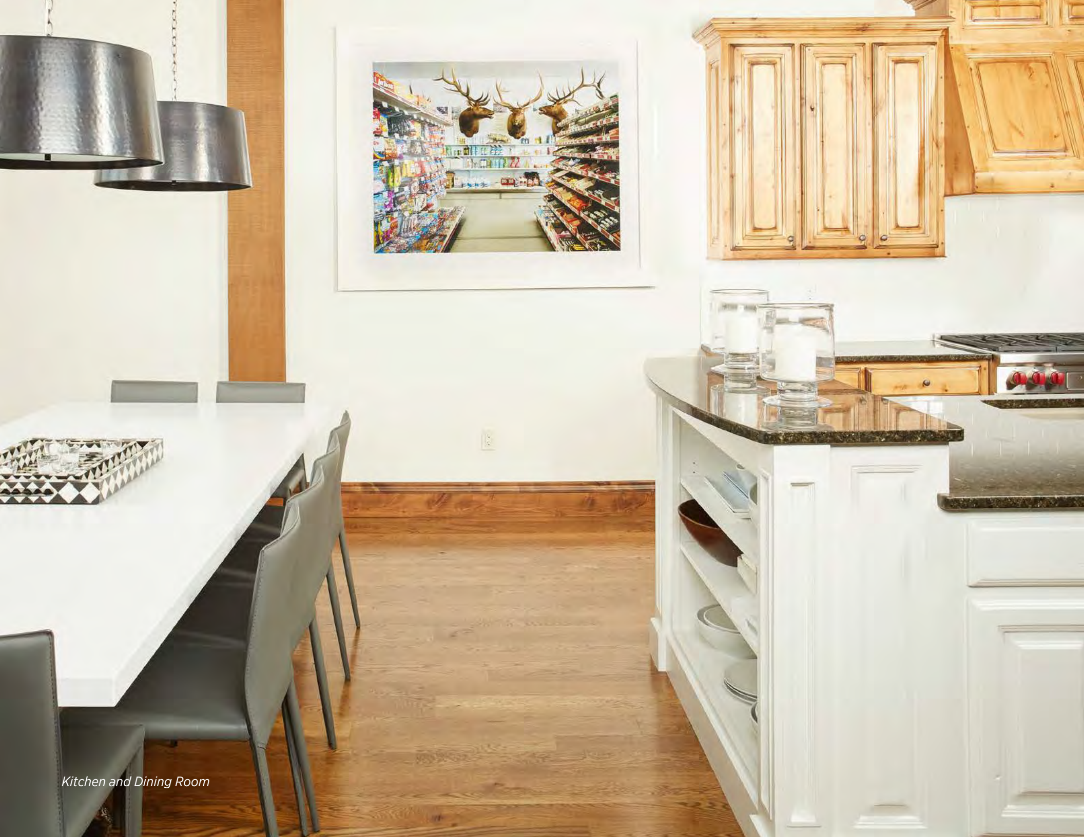
Kitchen and Dining Room