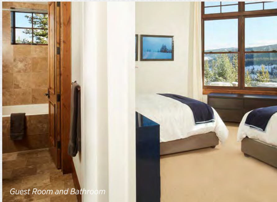
Guest Room and Bathroom