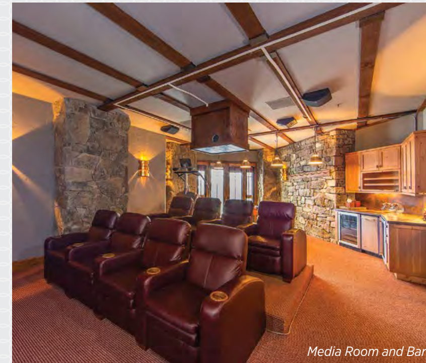
Media Room and Bar