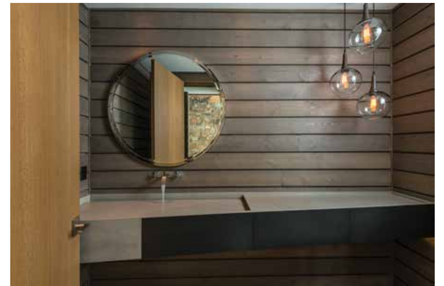
Elements Artisan Concrete created custom sinks for the bathrooms, some with sleek angles and others with unique curves.

The home is as much a reflection of the homeowners as it is of the local talent used to put it together. The collaboration between architect, builder, designers, and local artisans created a masterpiece that infuses innovation in design with comfortable living. The views are front and center, but family life comes first. ▲