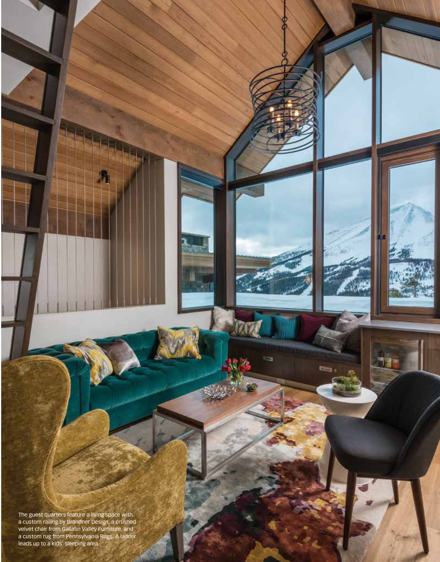
The guest quarters feature a living space with a custom railing by Brandner Design, a crushed velvet chair from Gallatin Valley Furniture, and a custom rug from Pennsylvania Rugs. A ladder leads up to a kids' sleeping area.

custom touches. A hidden liquor cabinet rises from the center of a kitchen counter, the great room TV is hidden behind a three-paneled painting, and another TV rises from the base of a custom bed frame in the master bedroom. "We got the best of everyone's talents," explains Clean Line co-owner Ashley Sanford. "We'd stand with these guys in a room and brainstorm about how we were going to pull these things off. They were all amazing to work with."