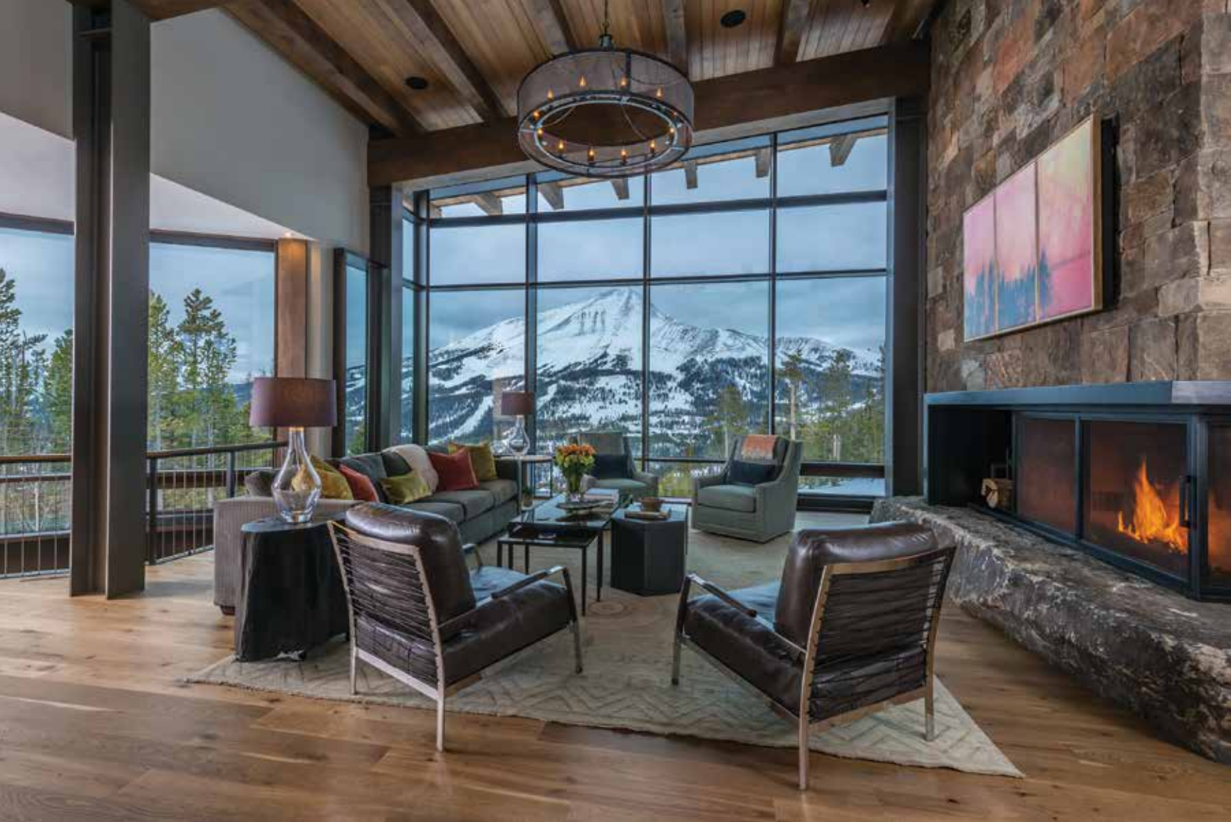
ABOVE: Lone Peak views are highlighted from the great room windows. A tree-stump end table from The Architect's Wife sits next to leather chairs from Montana Expressions. The custom light fixture is by Iron Glass Lighting. A three-paneled painting by the homeowner's father covers the flat-screen TV. SAV Digital Environments automated the panels to open with the touch of a button. BELOW: The front entry features a custom light fixture by Iron Glass Lighting and a painting by Pittsburgh, Pennsylvania-based artist Mia Tarducci. The custom staircase, leading to guest quarters, was built by Brandner Design.

he accomplished through a curved stairway, as well as staggered and offset building forms. From the office perched high to one side to the basement-level guest wing, the views remain intact.