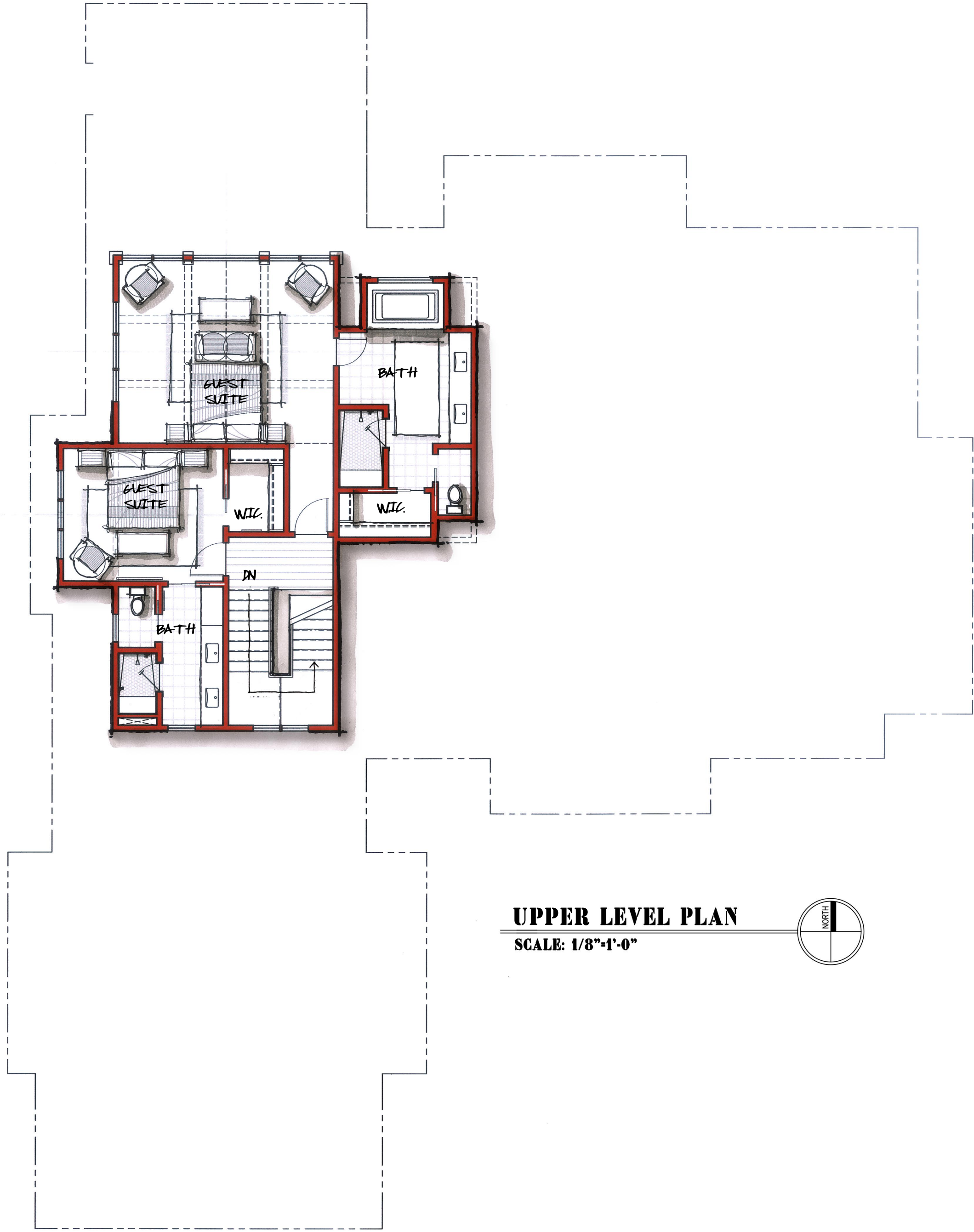
UPPER LEVEL PLAN SCALE: 1/8"=1'-0"