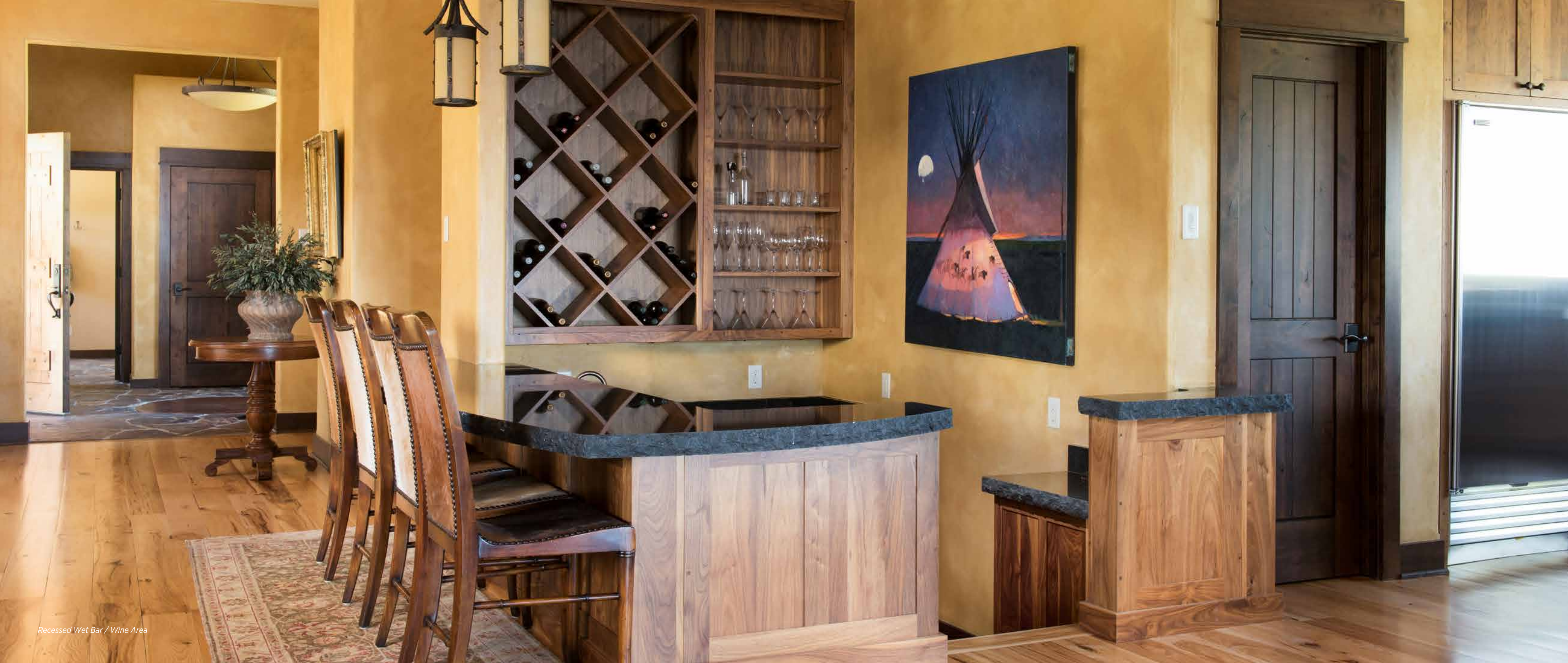
Recessed Wet Bar / Wine Area