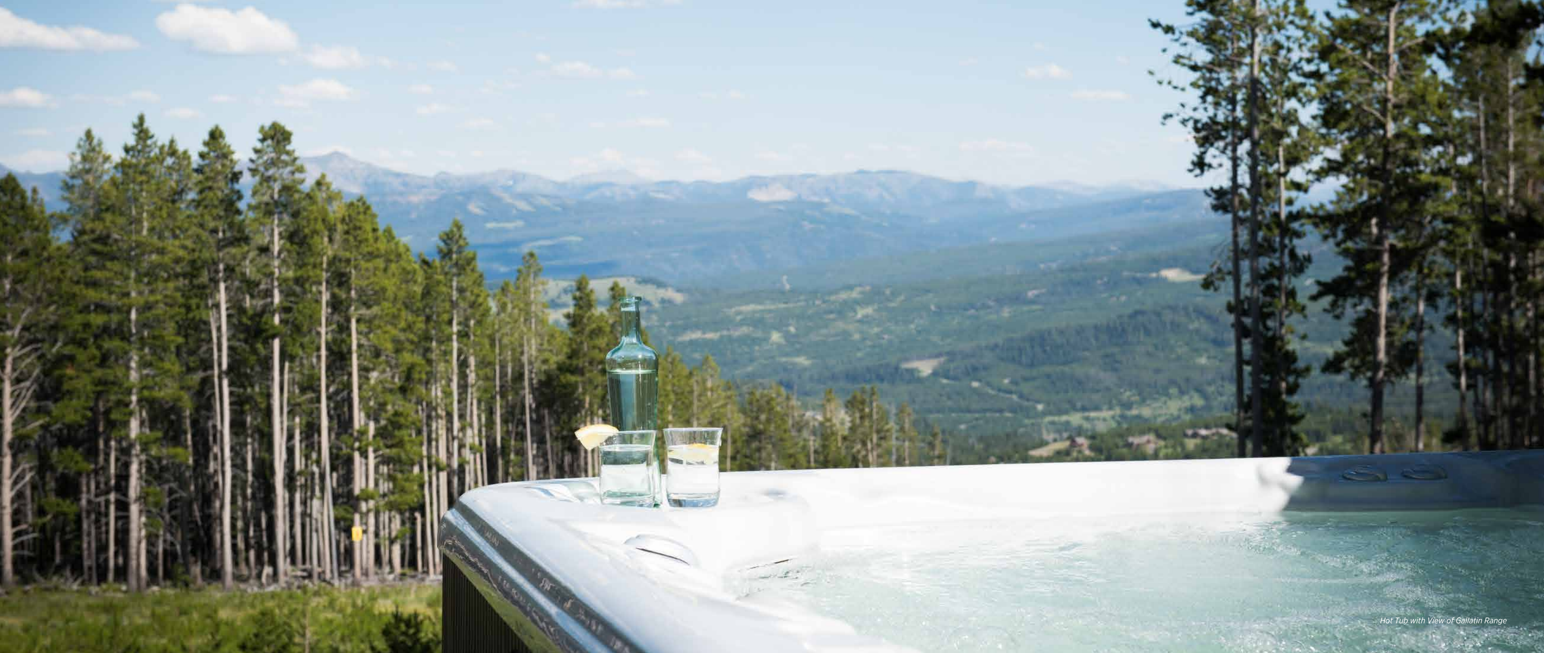
Hot Tub with View of Gallatin Range