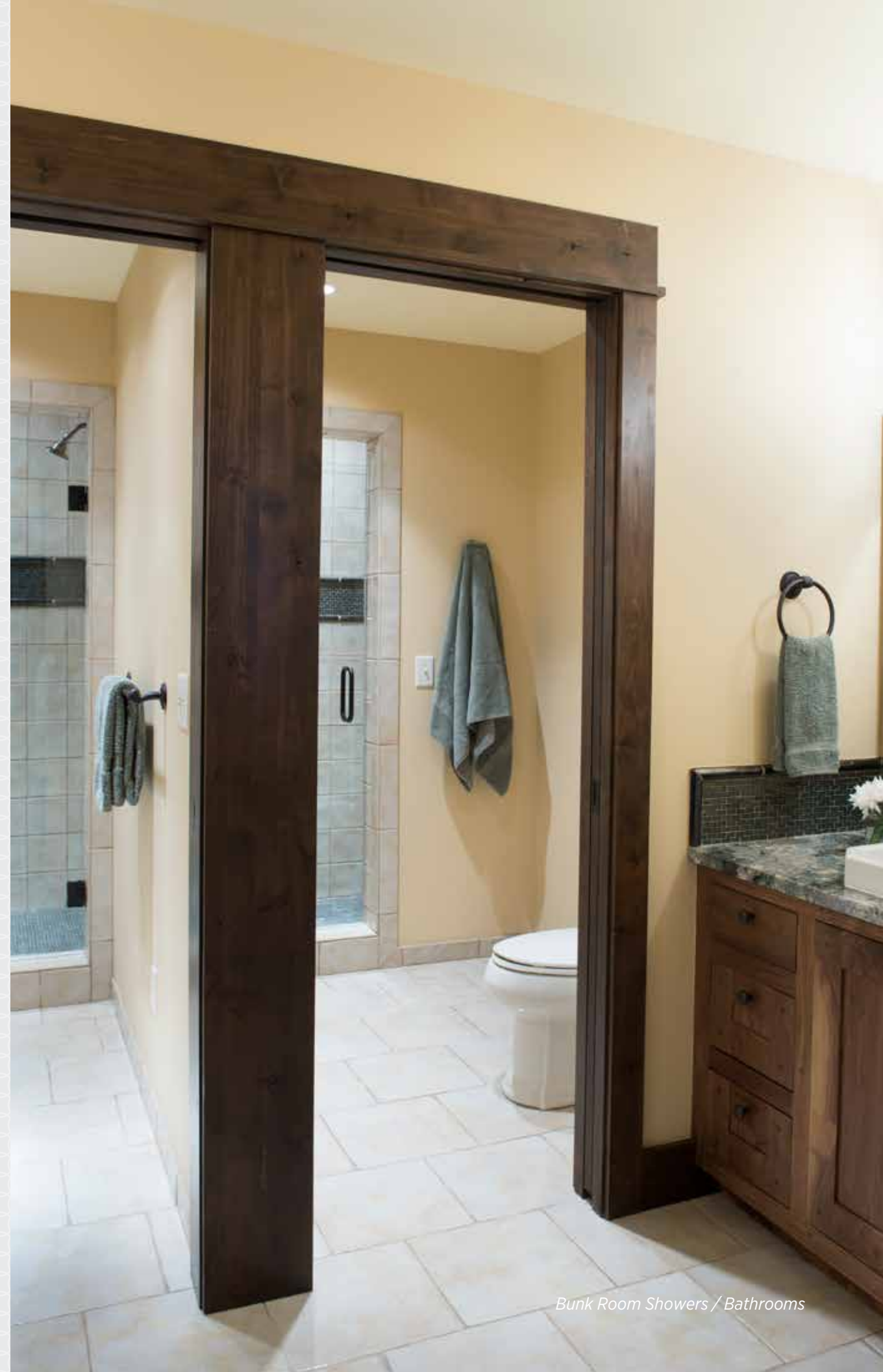
Bunk Room Showers / Bathrooms