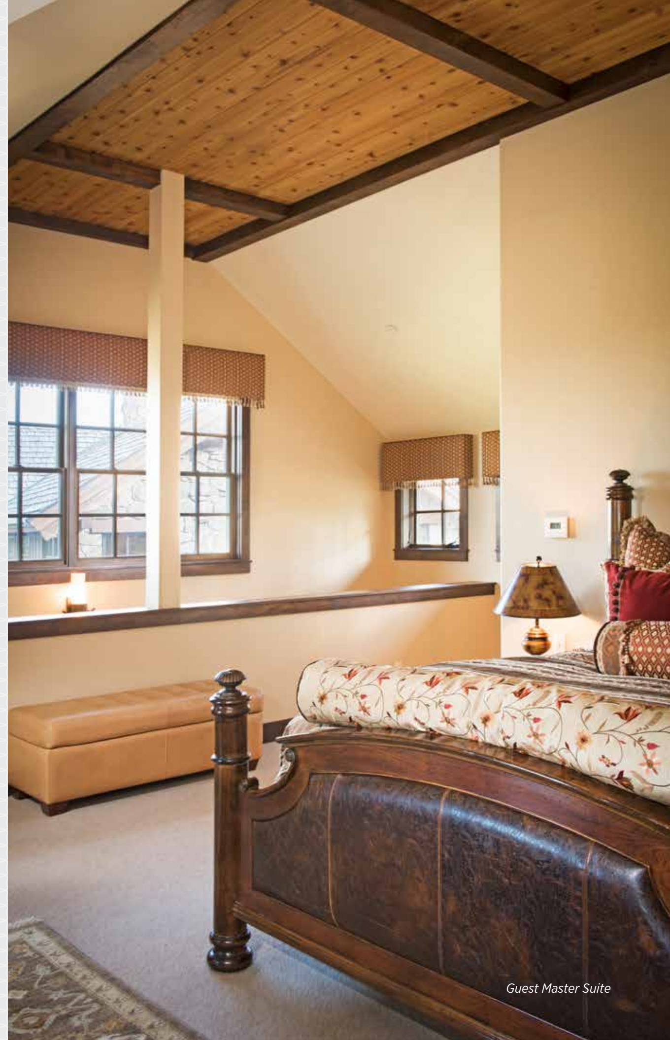
Guest Master Suite