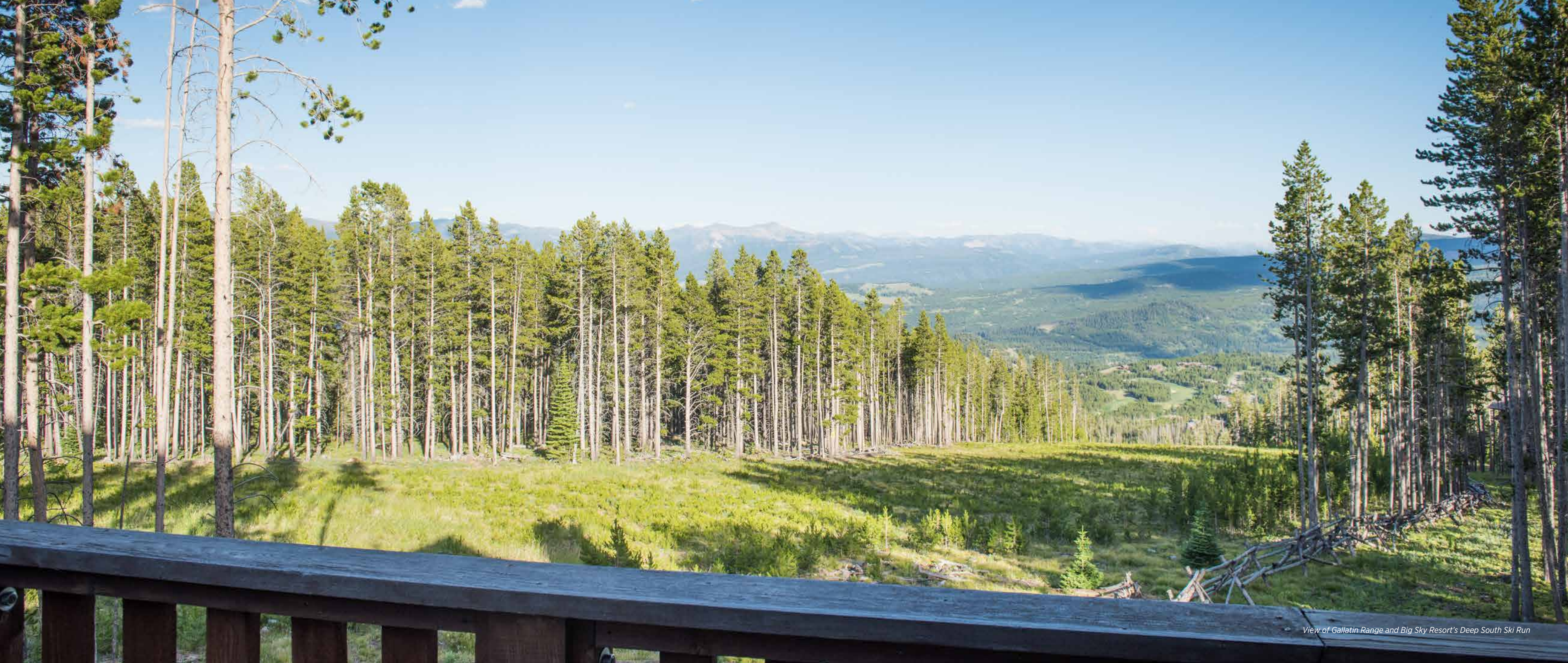
View of Gallatin Range and Big Sky Resort's Deep South Ski Run