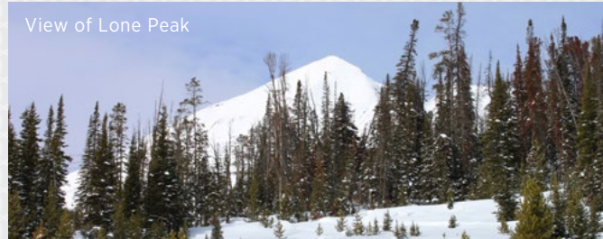
View of Lone Peak