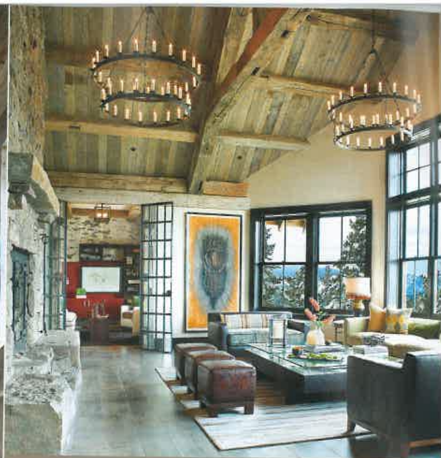
ABOVE: The home relies on typical Western materials, applied in both conventional and uncommon ways. The double-sided fireplace is made of Harlowton Stone from Montana. LEFT: The lounge takes the place of a formal dining room, which the owners felt they'd rarely use. The square iron tables were built by Custom II Manufacturing in Bozeman. BELOW: Embodying the home's rustic-contemporary vibe, the chainmail chandelier was custom-made by CP Lighting in Milwaukee.