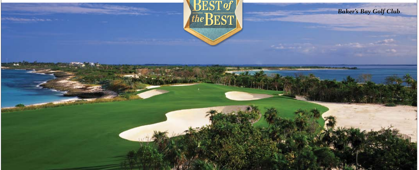
Baker's Bay Golf Club